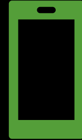
Digital Coach (DAP)