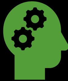
Knowledge Hub (Viva Learning)