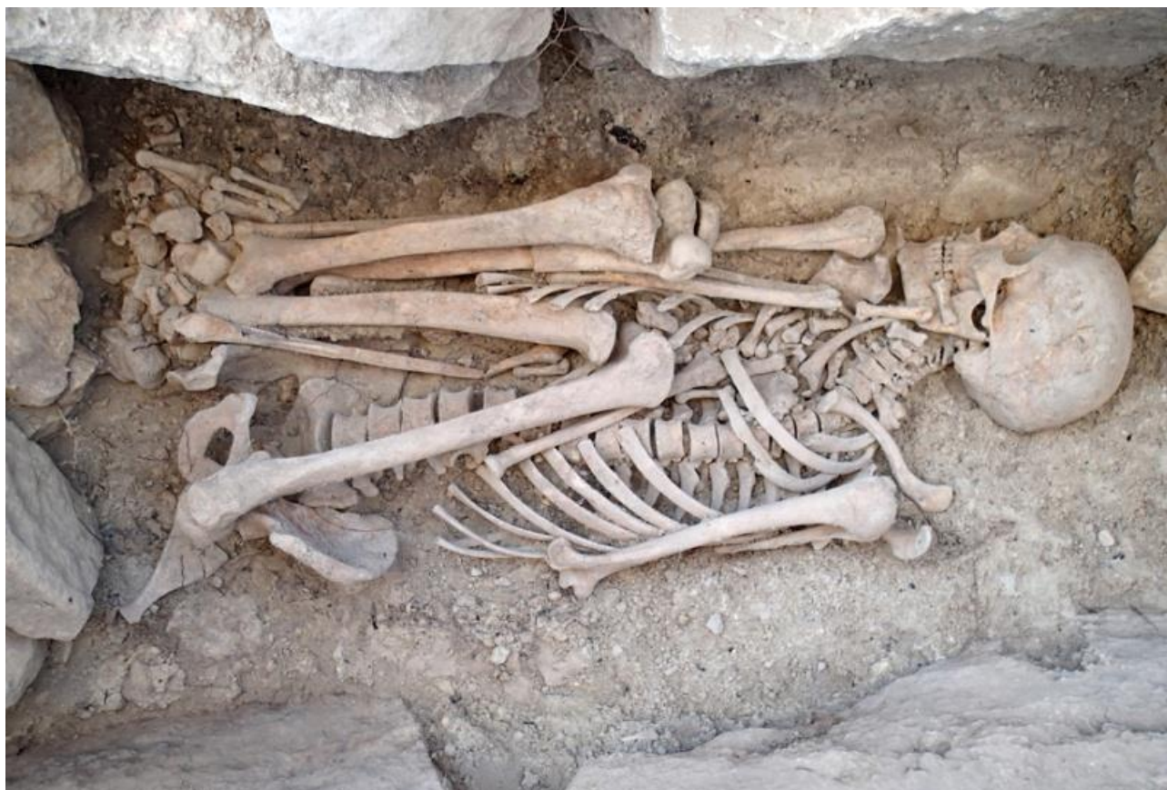
Figure 4 - The fully articulated skeleton in AY67. Although some minor displacements were observed, i.e. dispersal of some finger bones of the hand, opening of the rib cage under the weight of the left knee and shifting of the left arm, all of them account for a slow filling of the tomb once the body was already skeletonised.