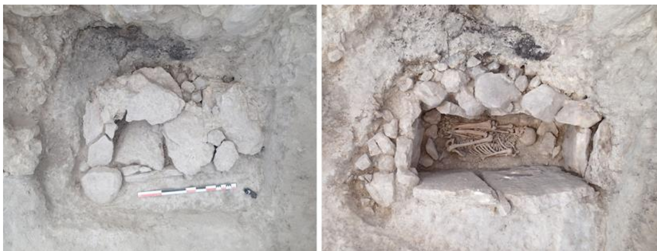
Figure 3 - General view of the tomb before being opened (left) and after full skeletal exposure (right).