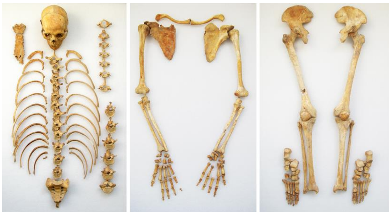
Figure 5 - AY67 skeletal conservation.

Analyses were performed in duplicate on a Thermo Flash EA/HT elemental analyser, coupled to a Thermo DeltaV Advantage Isotope Ratio Mass Spectrometer via ConFloIV interface (ThermoFisher Scientific, Bremen, Germany). Standards used were IAEA-N1, IAEA-C6, and internally calibrated acetanilide. Analytical precision was 0.25‰ for both \delta^{13}\text{C} and \delta^{15}\text{N} based on multiple measurements of the standard acetanilide.