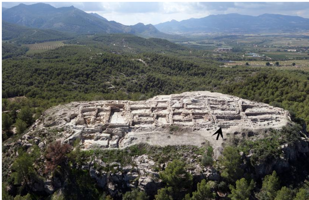
Figure 2 - Aerial view of La Almoloya with location of the tomb AY67.

Carbon and nitrogen stable isotope compositions were measured as the ratios of the heavy isotope to the light isotopes ( ^{13}\text{C}/^{12}\text{C} or ^{15}\text{N}/^{14}\text{N} ) and are reported in delta ( \delta ) notation as parts per thousand (‰), where \delta^{13}\text{C} or \delta^{15}\text{N} = (R_{\text{sample}}/R_{\text{standard}}] - 1) \times 1000 , and R is ^{13}\text{C}/^{12}\text{C} or ^{15}\text{N}/^{14}\text{N} , relative to internationally defined standards for carbon (Vienna Pee Dee Belemnite, VPDB) and nitrogen (Ambient Inhalable Reservoir, AIR).