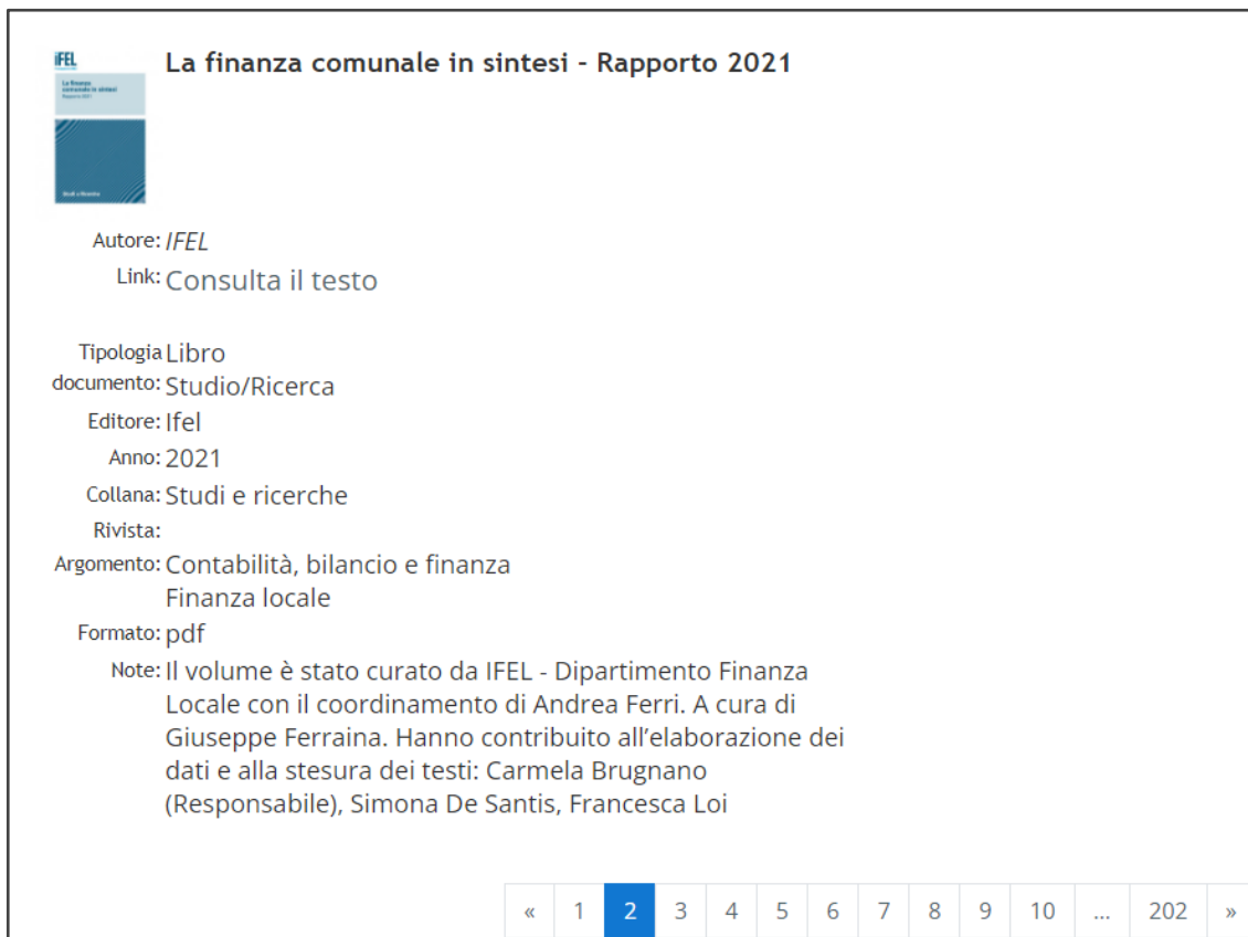
Figure 3: Digital Library: example of a full record