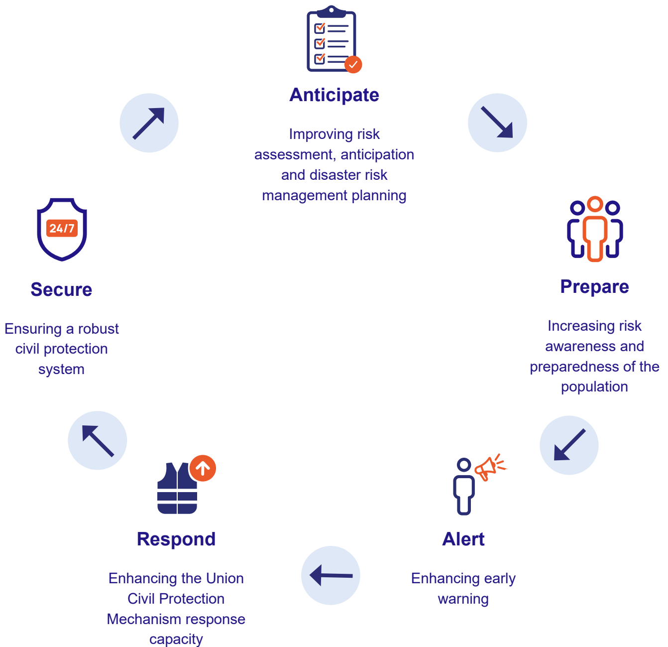
Figure 1: The goals strengthen the disaster prevention-preparedness-response cycle

The disaster resilience goals strengthen the EU’s efforts to make resilience a new compass for EU policymaking. 11 The Commission’s Strategic Foresight Agenda and the disaster resilience goals share a common objective, namely placing resilience at the heart of EU policymaking. Both look at the future to inform present decisions, drawing upon research, scenarios, trends analysis and other tools to increase Europe’s resilience. The disaster