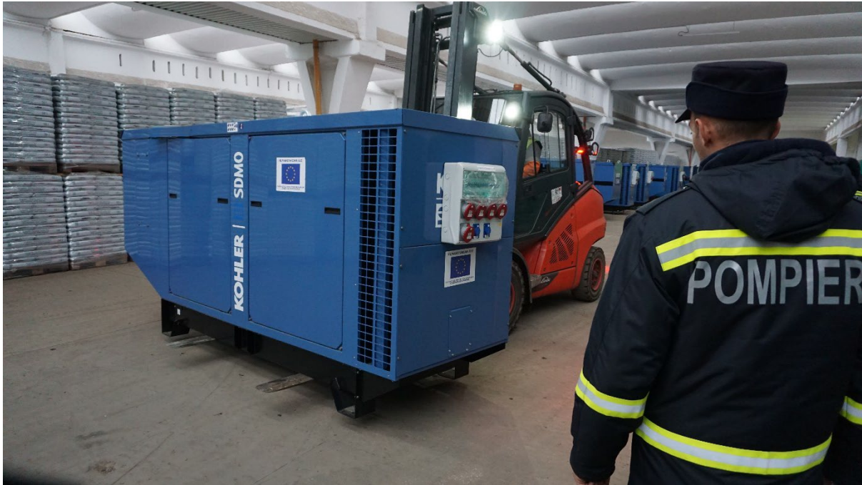
Delivery of rescEU power generators to Ukraine

In the context of Russia's war of aggression against Ukraine, the Union Mechanism has provided life-saving assistance with the largest and most complex EU civil protection operation since its establishment. It has delivered over 80,000 tonnes of in-kind assistance to Ukraine and its neighbouring countries, worth some EUR 500 million.