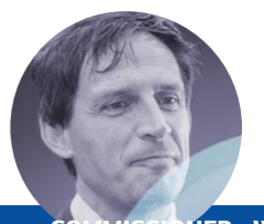
COMMISSIONER : WOPKE HOEKSTRA