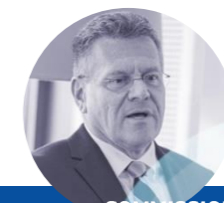
COMMISSIONER : MAROŠ ŠEFČOVIČ