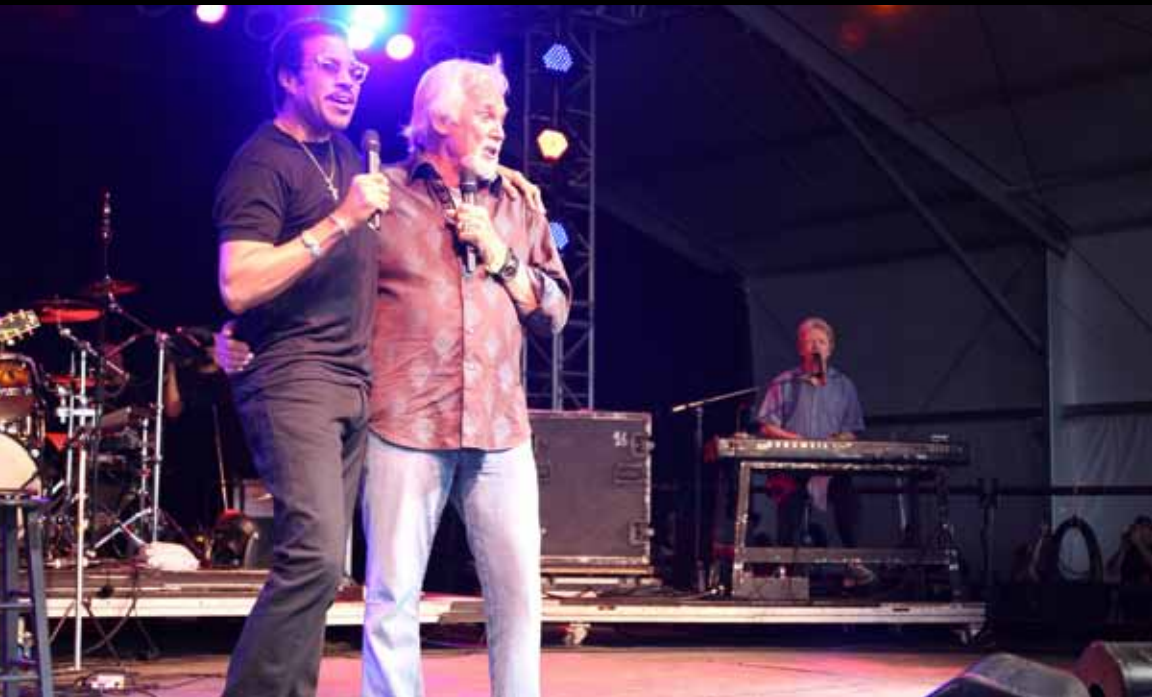
A great shot with the one and only Lionel Richie from the Bonnaroo Music and Arts Festival in 2012.