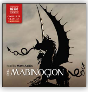
The Mabinogion Read by Matt Addis

Total running time: 13:04:40 Catalogue no.: NA0375 ISBN: 978-1-78198-269–3