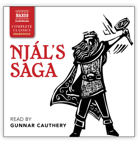
Total running time: 13:04:40 View our full range of titles at n-ab.com

Based on events that took place between 960 and 1020 AD, Njál's Saga is a mesmerising drama about a multigenerational cycle of violence and retribution, and the feuds and passions that perpetuate it. The eponymous sage Njál, known for his keen legal mind, is one of Iceland's pre-eminent men, along with Gunnar of Hlidarendi, a fierce and formidable warrior married to the diabolical Hallgerd, whose conniving instigates the interminable pattern of romance, action and brutality – until one unforgivable act ends it all. Njál's Saga is considered the greatest of the Icelandic sagas and is notable for its historical value, as it provides glimpses of a society transitioning away from the Iron Age to the Middle Ages, and establishing the social and legal mores of its present.