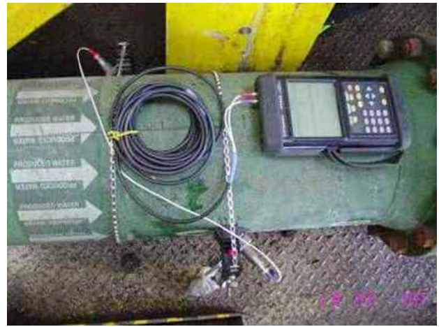
PT878 in use on 12-inch Produced Water line, with insertion-turbine 3D downstream

(\text{Well shutdown cost} + \text{new meters or spare parts cost} + \text{Labor cost}) \times \text{Number of Days Shutdown.}