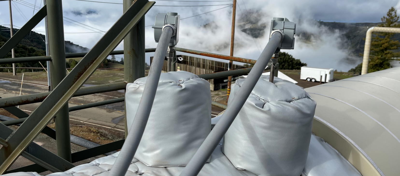
Calpine's Lake View U-17