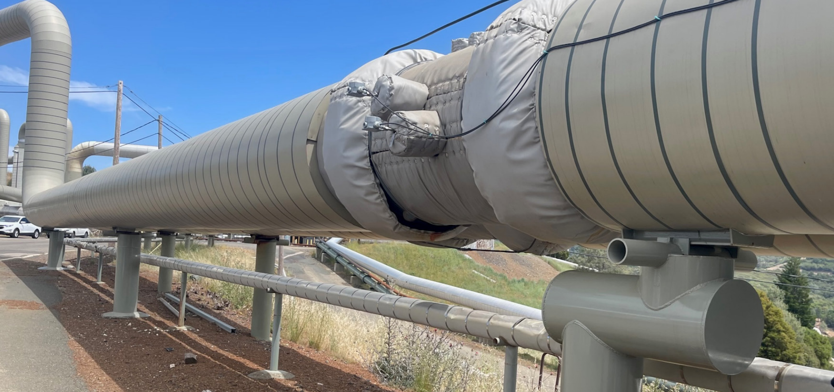
Calpine's Ridge Line U-7/8