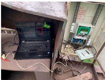
Picture 1. Replacement of AT868 flow meters on the Coke oven battery.