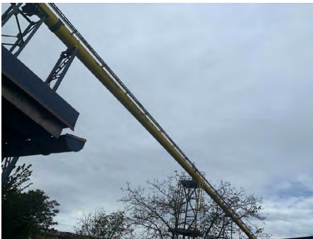
Picture 12. DN800 coke oven gas

Two applications from 2002 on raw coke oven gas DN1200 (48") and still working well.