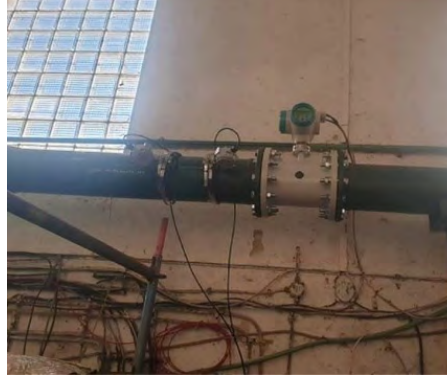
Pictures 6-7. Clamp on installed behind a magnetic flow meter for drinking water