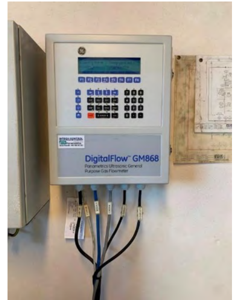
Picture 9. Panametrics DigitalFlow GM868

Both chimneys were originally equipped with long path tilted diameter solutions. Although replacing like for like, Panametrics recommended changing the setup of the ultrasonic path. The customer agreed and replaced the tilted diameter to bias 90 which has proven to provide a higher immunity to gas wetness and dirt.