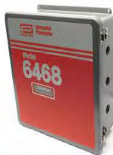
Picture 8. 6468 electronics

The 6468 electronics (Picture 8) that was installed in 1996 was replaced by five PanaFlow XMT1000 Ultrasonic Flow transmitters in 2021. While the WT wetted transducers still worked well, the 6468 electronics were obsolete after 25 years of service. The customer now benefits from even better accuracy, communication and diagnostic performance.