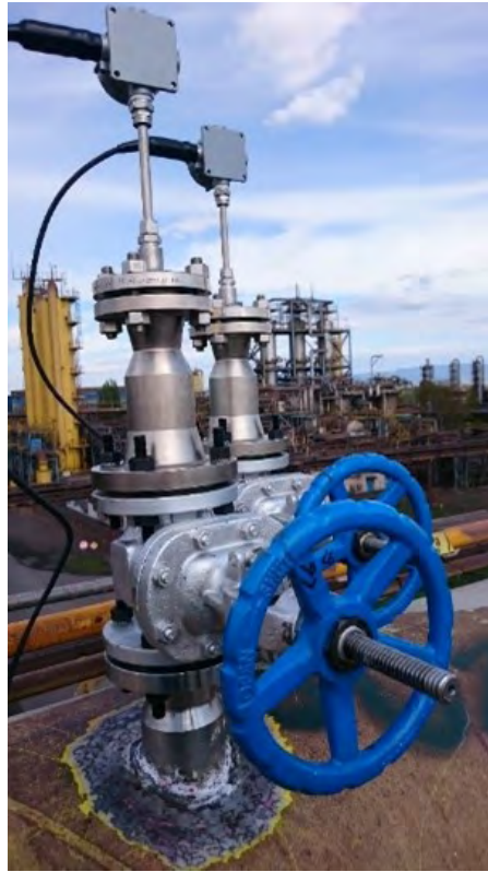
Picture 13. Bias 90 T5 setup