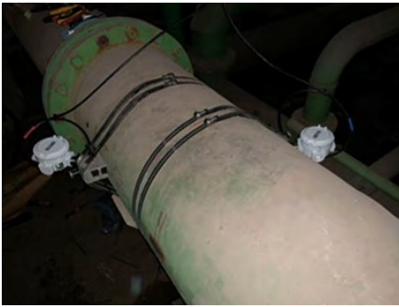
Picture 3. 50-year-old corroded pipe