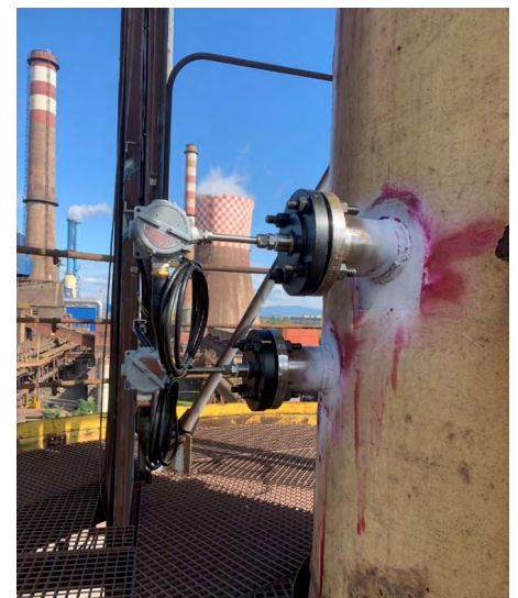
Picture 10. Combustion chimney with a T5 bias 90 setup on a DN800 (32") pipe for blast furnace gas.