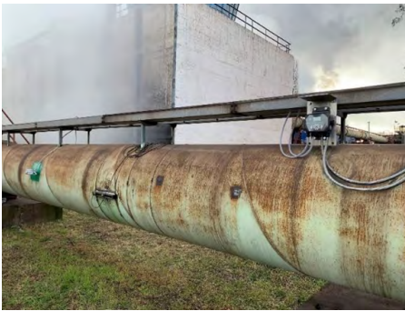
Picture 4. AT600 with WT wetted transducer solution from 1995