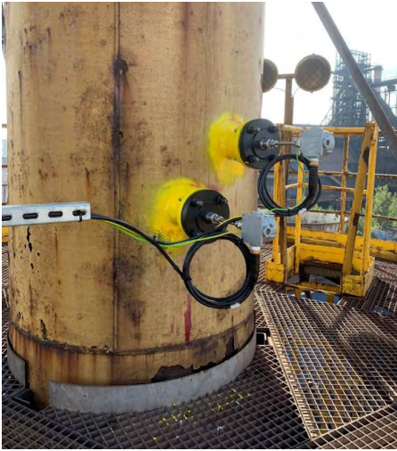
Picture 11. Combustion chimney with a T5 bias 90 setup on a DN1200 (48") pipe for blast furnace gas

Two applications from 2002 on raw coke oven gas DN1200 (48") and still working well.