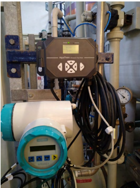
Inline and clamp on electronics

The customer was impressed by Panametrics technology and the Channel Partners' hands-on approach. Most importantly HEP was extremely happy it could continue the startup process without further interruptions.