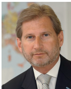
Johannes Hahn Member of the European Commission

The 3 RD ANNUAL FORUM OF THE EUSDR is a big opportunity to meet, discuss and decide the future of the Danube Region. It is about perspectives for our citizens. We look forward to meeting you in Vienna.