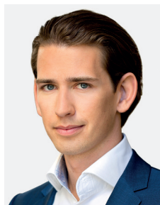
Sebastian Kurz Federal Minister for Europe, Integration and Foreign Affairs, Austria