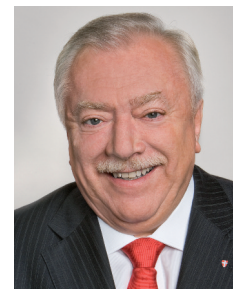
Michael Häupl Mayor and Governor of Vienna