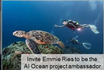
Promote the "AI Ocean-Marine Life Database" Project (Search #AIOcean)