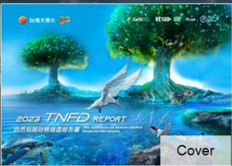
Release the first TNFD Report (The Taskforce on Nature-related Financial Disclosures)