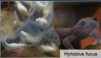
Promote the "Hynobius" Conservation Program