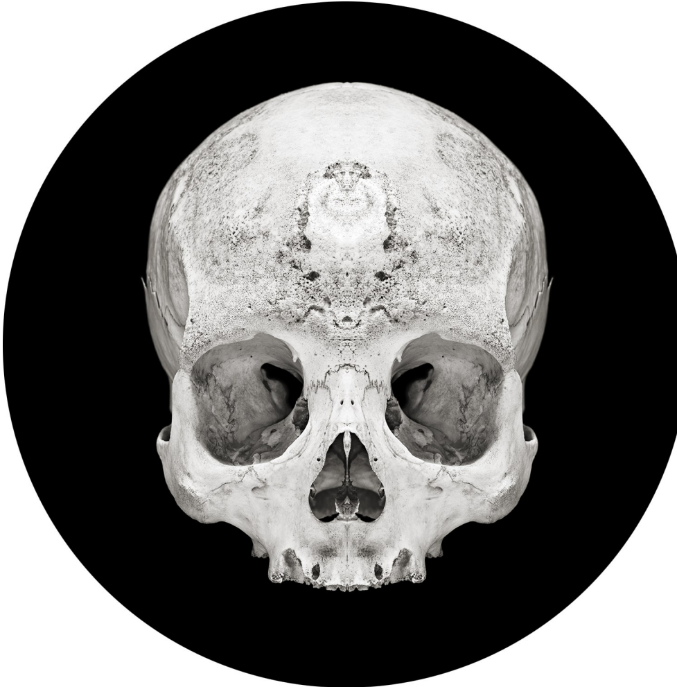
“Syphillis” from Orr’s Exhibition, Perfect Vessels , at the Mütter Museum through January 5 th , 2017.

During this, I'd learned that if one photographed then mirrored half a human skull facing camera, it balanced perfectly without signaling that it had been manipulated (as we immediately notice in a human face so altered). I began to look for subjects to photograph. You'd be surprised at how many skulls will turn up if you ask around, particularly in Los Angeles, where one quickly learns that skulls are where the interests of physicians, medical illustrators, students, artists, and rock & rollers intersect. After exhausting those avenues, I began to seek a larger collection. A colleague, knowing my connection to Philadelphia, recommended the Mütter Museum. It's worth mentioning here that, even in the weird Philadelphia of my youth, the Mütter's reputation was formidable. Pre-internet, one heard only tales of a lady whose corpse had turned to soap; a skeleton where the bones had fused together; the world's largest colon; slices of Einstein's brain; etc. It sounded like a place to go on a dare, or to avoid altogether. Now, it just seemed fascinating.