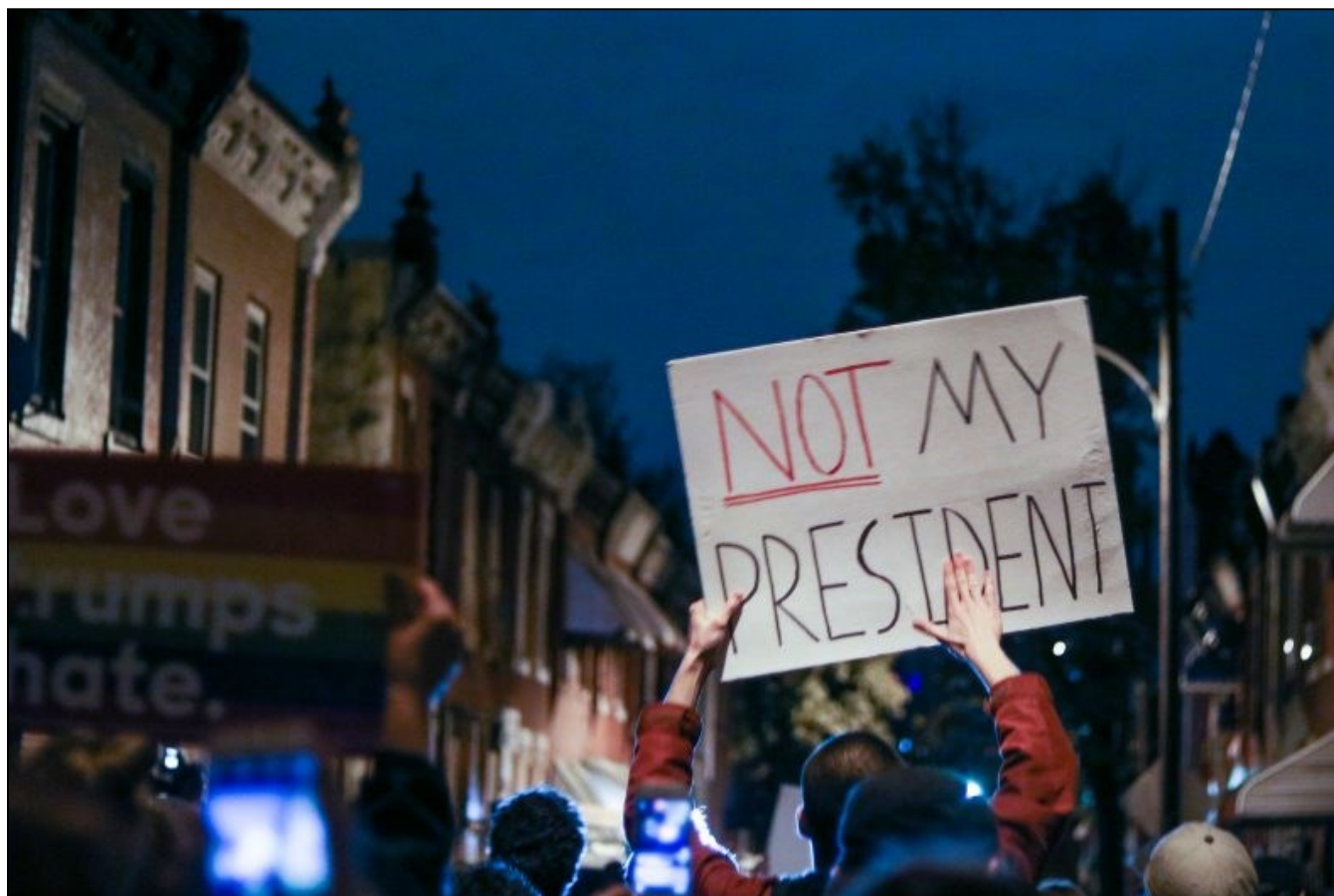
Temple Students Protest President Trump’s Inauguration