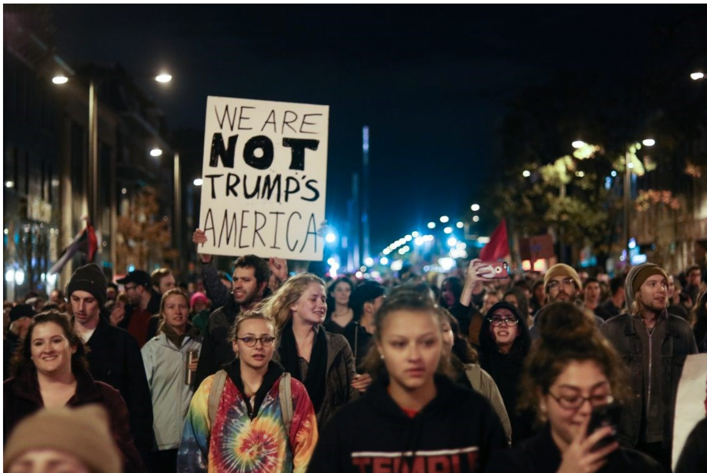
Temple Students Protest President Trump's Inauguration