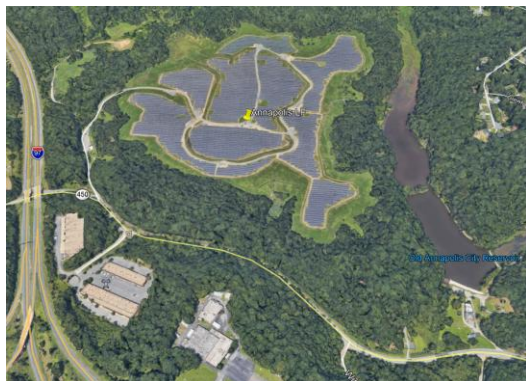
Annapolis LF, Anne Arundel County

We have heard that the County governments that own Glen Burnie LF in Anne Arundel County and the Southwest Area Park (a former landfill) in Baltimore County were in discussions with solar providers as well.