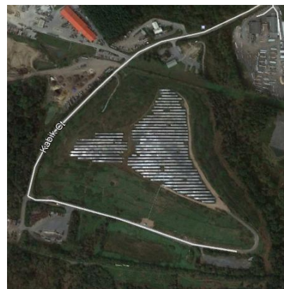
Hood's Mill LF, Carroll County