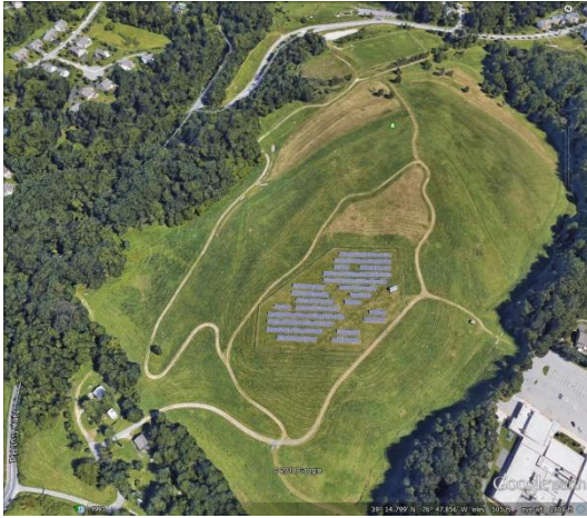
New Cut Road Landfill, Howard County