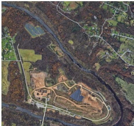
40 West Landfill, Washington County