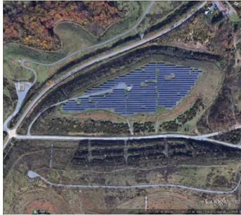
Resh Road Landfill, Washington County