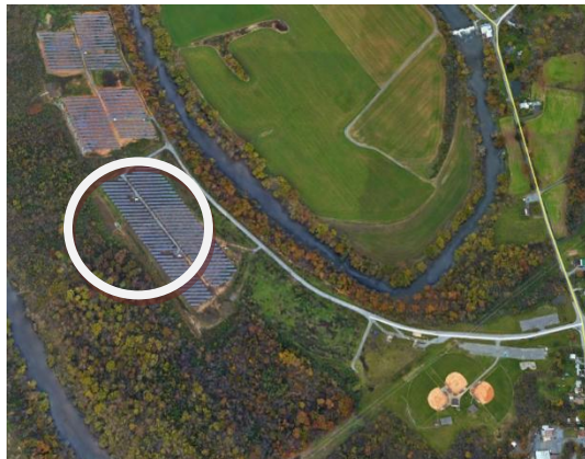
Maietta Rubble LF, Washington County