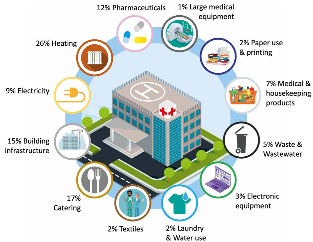
FIGURE 1: Proportion of the global warming potential of an average Swiss hospital