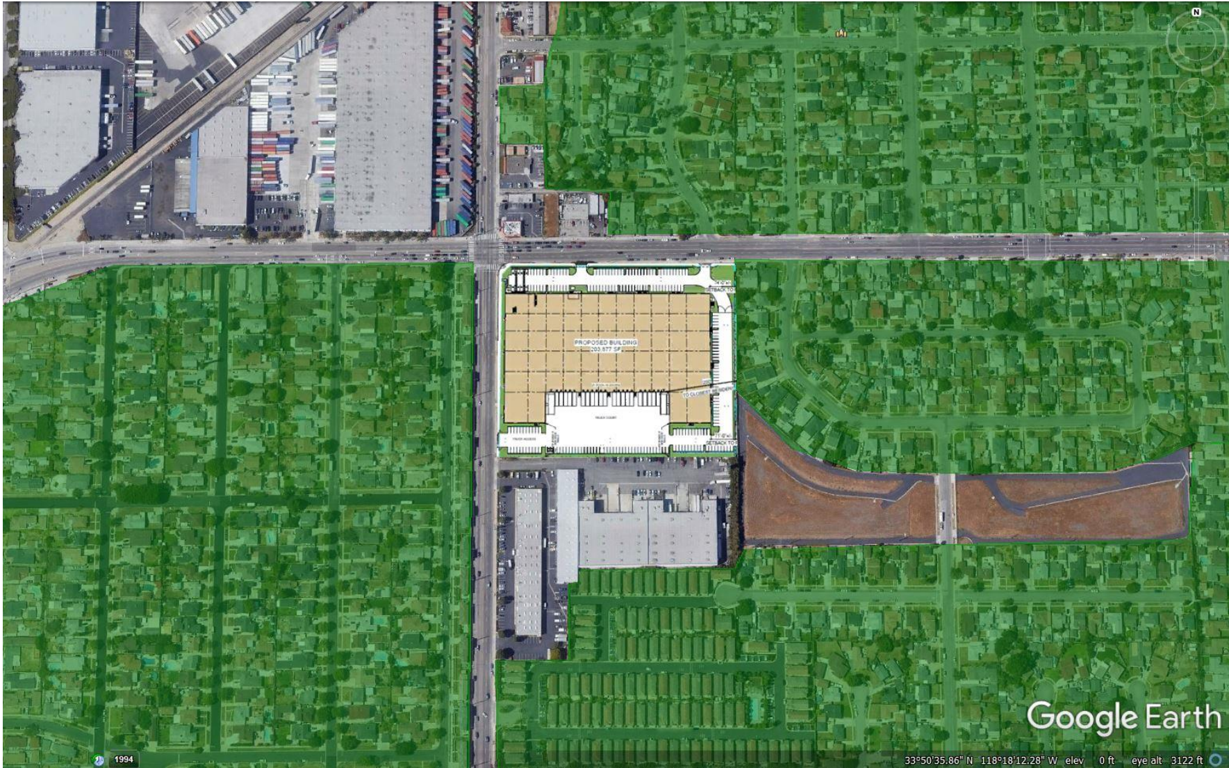
Image of the proposed Project and adjacent land uses, with residential uses highlighted in green.