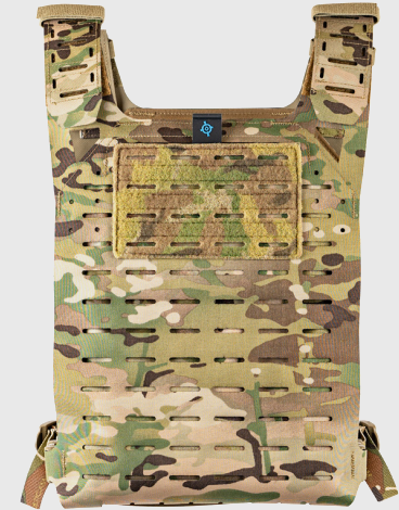
PLATE5 is built with the same fully MOLLE compatible MOLLEminus platform as the original PLATEminus™. This provides fully modular load carriage capability but significantly reduces weight and bulk over traditional armor carriers. PLATEminus™ is built to hold SAPI / ESAPI armored plates and has fully enclosed plate pockets which protect the plates. It provides maximum signature management by eliminating black plates or the need for additional “socks”.