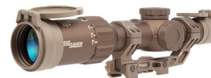
TANG06T DVO 1-6X24MM (FFP)