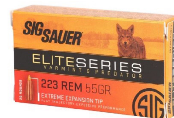
223 REM, 55GR, VARMINT AND PREDATOR