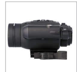
QD 1.535" Mount