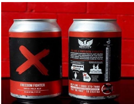
Food & Drink

Let your creativity shine and support Polaris's mission while doing it! If you're looking for a unique way to fundraise, consider creating products you can sell, while also supporting victims and survivors of human trafficking. Before creating your own products, read through Polaris's guidelines on best practices to use when promoting your products and learn what you are responsible for. Check out what some of our supporters have created in the past!