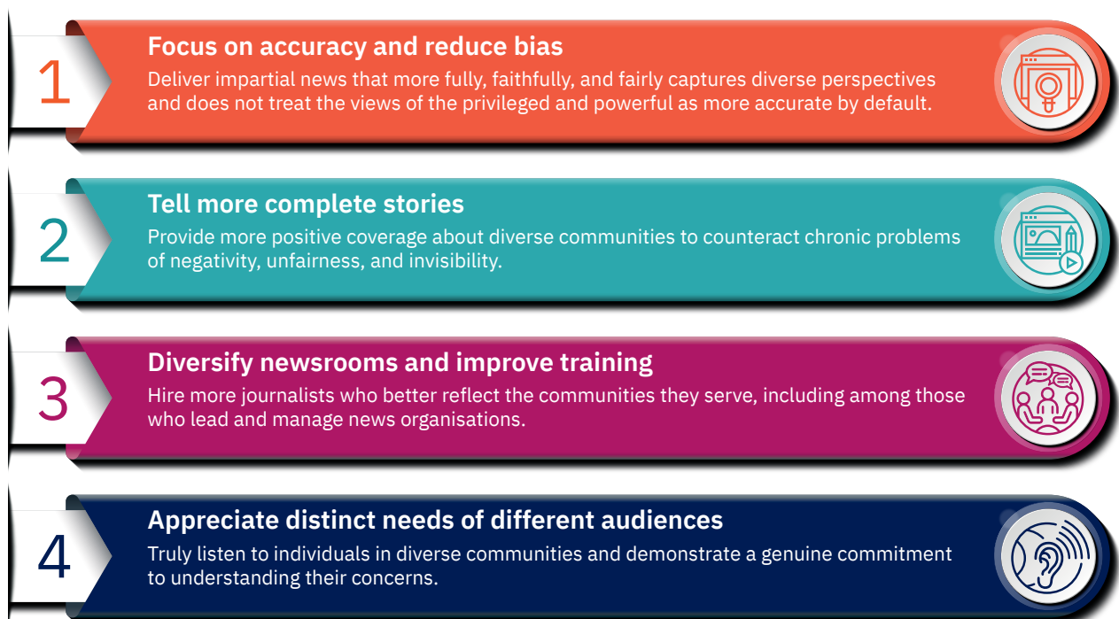
Figure 2. Recommendations from disadvantaged audiences for building trust