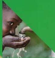
WATER & SANITATION