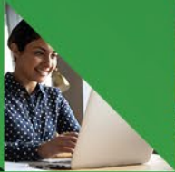
EDUCATION & RESEARCH