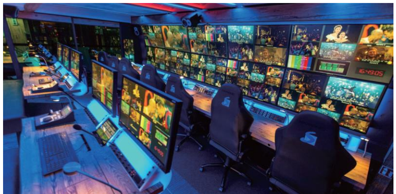
The interior of the Ü8 broadcasting van. Switches by Omada included.

To meet the high demands of 30 HD streaming workstations, a high-bandwidth data transmission system is essential for a reliable video broadcast. The two primary L3 switches, SG6428X, are interconnected via a trunk connection, enhancing data throughput between switches without the need for additional cables. The inclusion of four 10 Gigabit SFP slots ensures the SG6428X switches deliver superior speed and reliability.