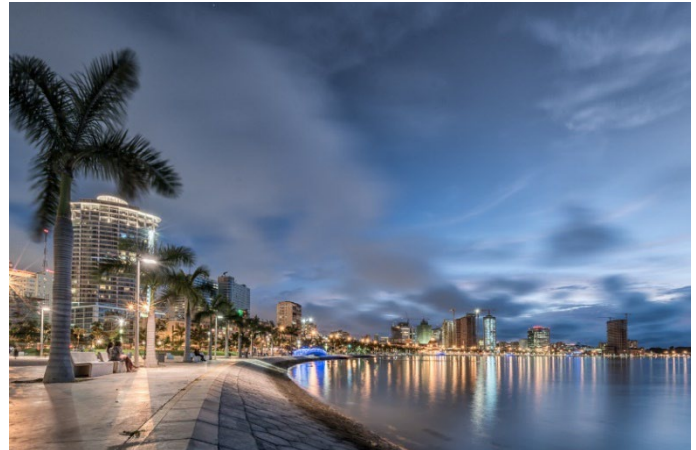
Luanda's waterfront

Borrowers of IFL can fix the reference rate for all or part of the disbursed amount for the whole or partial maturity of the loan. They can also unfix or refix the reference rate at any time during the life of the loan 1 .