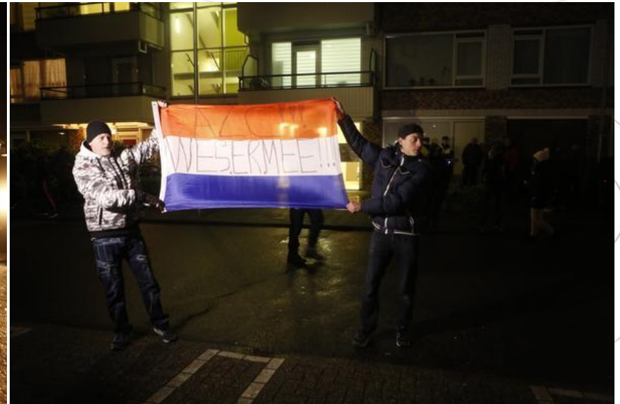
Pictures in Newspaper: Grimmige sfeer bij azc-bijeenkomst Overvecht , Telegraaf, 11-01-2016