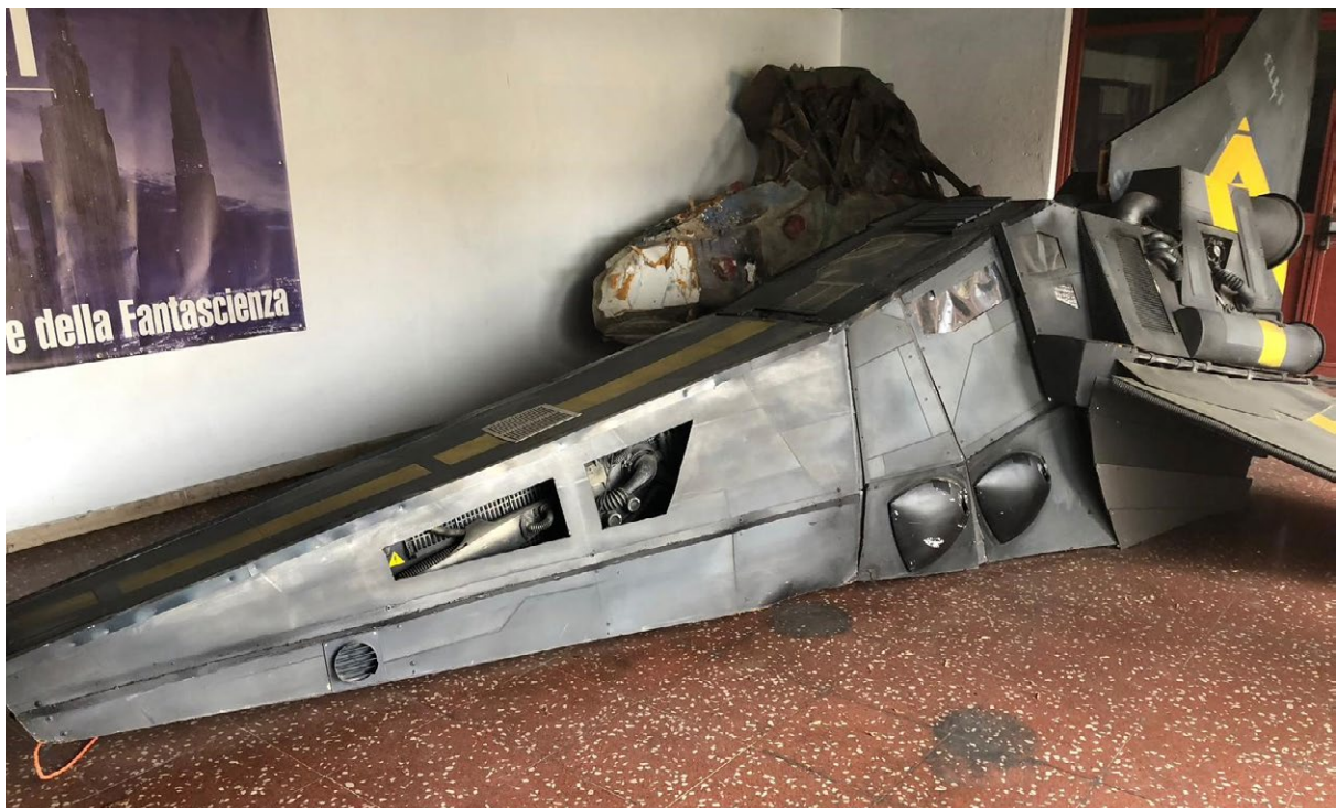
Site visit MUFANT pact, October 25, 2018.

The greatest challenge that the pacts’ signatories want to face is to attract to the museum visitors among the residents of the neighborhoods, that are not usual visitors for the Museum that instead attract people from all over the City 13 . The pacts’ project is thus installed within an ecosystem that is able to produce relevant output in terms of urban regeneration and the connection with the Museum is strong. The outdoor activities of the pact would be functional to the Museum and they would be able to reinforce the Museum’s offer and attract a bigger and more differentiated basket of visitors. The MUFANT pact presents a high degree of civic entrepreneurial capacity, since the pact proposals are willing to acquire a space to potentially enlarge the pacts’ activities.