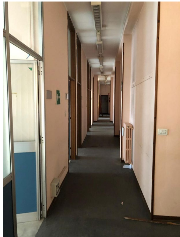
Site visit, Habitat pact, 26 October 2018.

This pact proposal seems so far to be one the most advanced ones, since three design principles are assessed as strong except for the Enabling State which is moderate mainly due to the lack of public funding however compensated by the