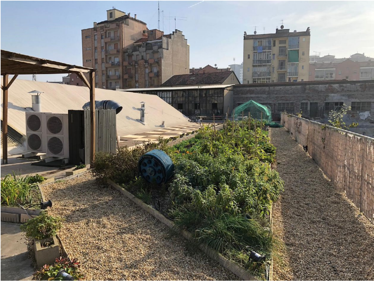
Site visit Casa Ozanam pact, 25 October 2018

The Casa Ozanam Community Hub, which aims at turning into a Neighborhood House, that is still lacking in the fifth district of the City.