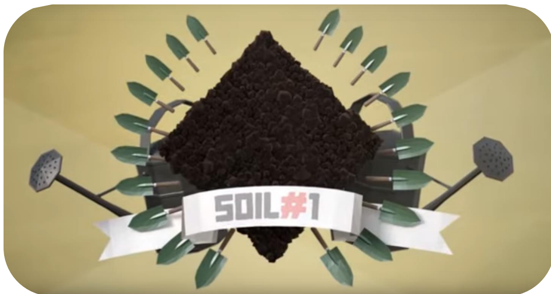
Video: "Let's talk about soil"; Produced by FAO

The produced soil can have a variety of applications. In agriculture, soil is necessary because of its nutrients, vital for plants that will produce food consumption. Similarly, in gardening, plants require nutrients from the soil. For green walls and roofs, soil might not have stringent requirements as plants are often grown for decorative purposes but increasingly also edible plants are being planted, therefore nutrient requirements apply for a light soil, possibly with low clay quantity. Finally, the soil can also be used for construction (e.g. embankments), but in this case it would not need as much nutrients as for gardening, therefore the soil mixture will be adjusted. Ultimately, this produced soil will be branded, in order to create more awareness with citizens about the benefits of their local high quality recycled soil instead of the supermarkets' packed soils with unknown origin and quality. As the project is currently very involved in the setup of the community gardens, a series of promotional actions have been thought of, such as where people could bring their organic waste and exchange it for a bag of soil.