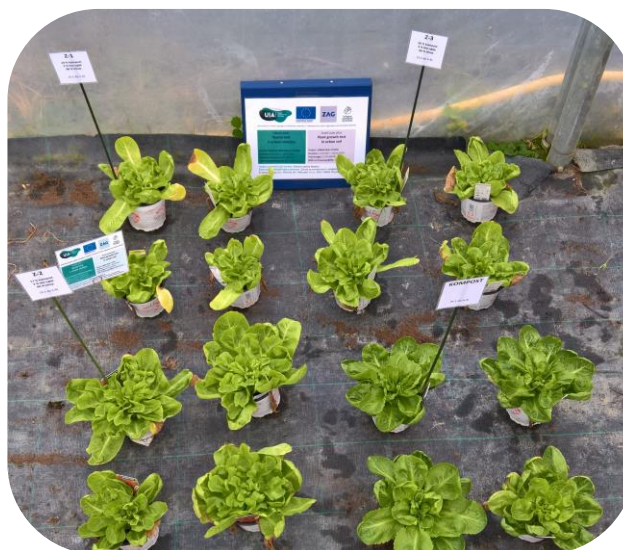
Image 2: Lettuce growing in different kind of soils produced from urban waste; Source: ZAG

From the point of the construction sector there is a lack of guidelines, protocols or any kind of instructions for the last phase of geotechnical and earthworks works, for example in relation to greening of the soil surface. Meaning that all aspects of construction are clearly defined and followed by belonging standards and guidelines (for example with for concrete mixtures, etc.). Yet, when it comes to the final layer outside the buildings, as for the garden, lawn, mound or dyke, no guidelines exist. Nevertheless, this is the most important layer, as it is being used either for food production, playgrounds or any other application and is under constant influence of wind erosion, water infiltration, etc. and consequently affects all underground layers and underground waters. Therefore, it is a great interest of ZAG to tackle this issue by establishing a laboratory system for testing and evaluating this final layer and bringing more pedagogical knowledge into the traditional construction knowledge.