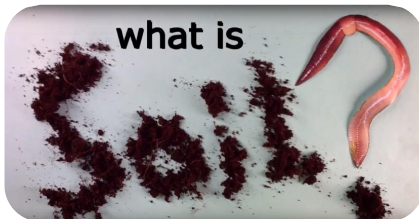
Video: “What is soil”; Produced by EEA

Soil is essential for production of food, for ensuring quality green spaces and a liveable environments. Yet, the ability of soil to deliver ecosystem services, in terms of food production, as biodiversity pools and as a regulator of gasses, water and nutrients, is under increasing pressure. Current rates of soil sealing, erosion, contamination and decline in organic matter all reduce soil capability for growing plants. Land degradation is largely connected to soil sealing, which affects the infiltration capacity and the soil biodiversity 1 . Furthermore, the land degradation includes soil erosion, loss of organic matter, the decline of the surface and groundwater regime and nutrient enrichment. Land take, soil sealing and degradation thus seriously affect the delivery of ecosystem services, such as water regulation, food production and carbon retention 2 .