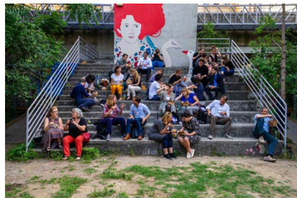
Bar & Mural