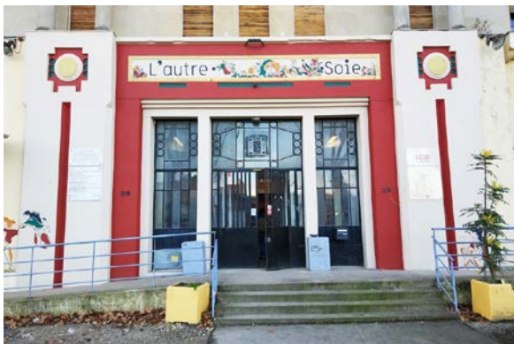
Entrance L'Autre Soie

The institutional and policy context for housing has been an important factor in project design and implementation. Such a project would be challenging to envision in a city without a large municipal housing company like Est Metropole Habitat, for example. The existing working relationships between some of the partners will help to support scaling. For example, the Groupement d'Interet General la Ville Autrement is a grouping of local housing and accommodation providers: Alynea, Fondation Aralis, Est Métropole Habitat (EMH) and Rhône Saône Habitat (RSH). They are already committed to working together in the East of Lyon to deliver solutions for affordable housing to vulnerable groups. The Instance du Protocole de l' Habitat Spécifique (IPHS) mentioned earlier in the journal is another entity that can play a central role in scaling up the solutions from this project within the Metropole.