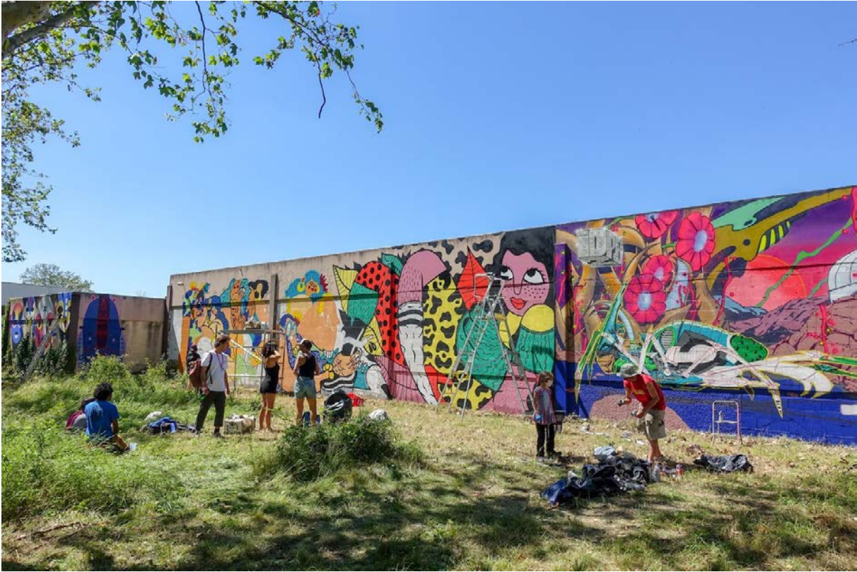
Legend: Mural and Park

The project currently benefits from the strong support of the political leadership of the Metropole and Villeurbanne. Local elections will take place in 2020, which might change this. This is the first time that the Metropolitan level will hold such elections. A change in regime might entail some risks for the project but it is difficult to anticipate this. The strategy of the partners is to continue to advance the implementation and to demonstrate positive impact in order to shore up support.