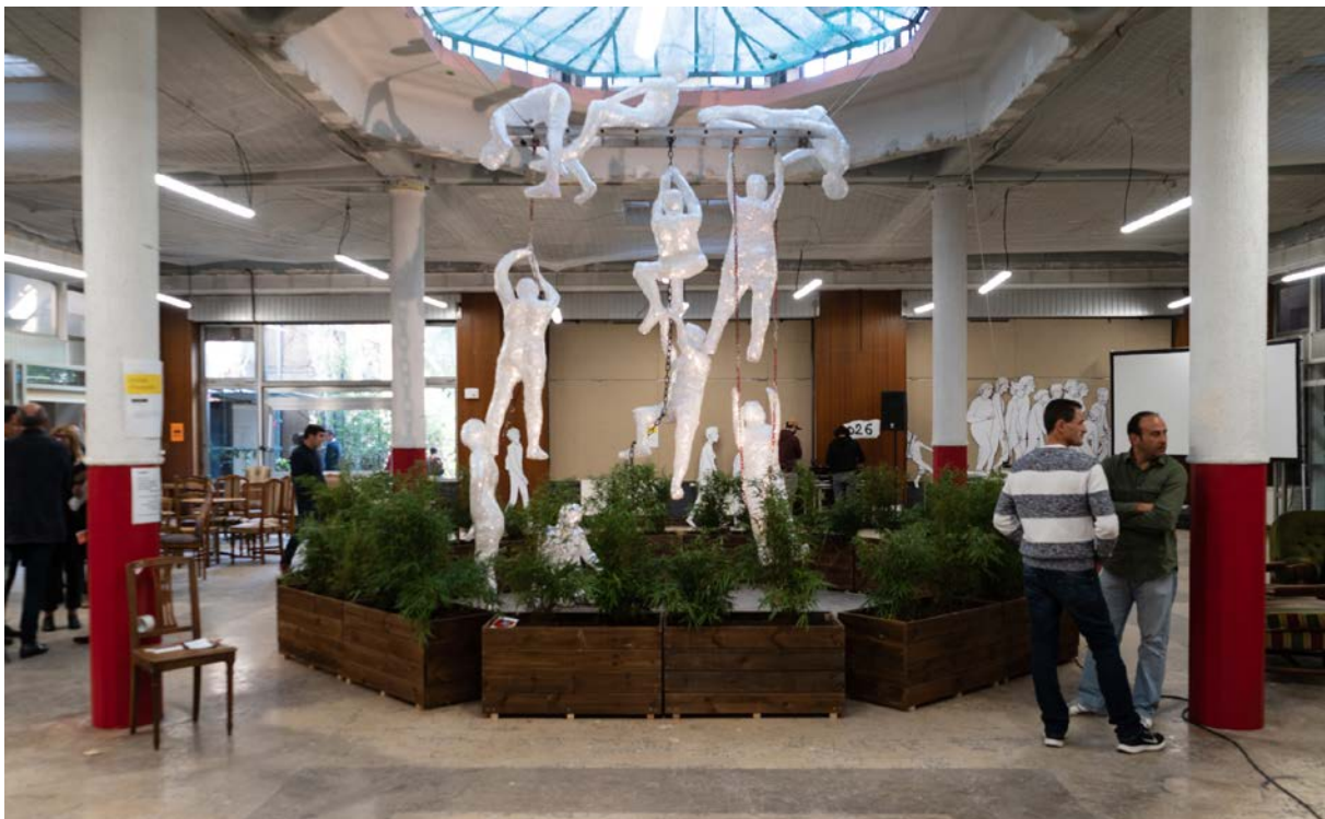
Sculpture Installation (Credit L'Autre Soie)

The first phase has involved all project partners in elaborating the evaluation questions, evaluation criteria and indicators that will be used to assess them. This took place in a participatory workshop, which allowed for a range of perspectives and some creative and critical thinking. The aim is to use collective intelligence to focus on the most important questions at stake in this project and identify the right criteria and indicators for assessment. The participative approach to evaluation design helps generate iterative learning. Partners have been encouraged to play an active role, rather seeing the evaluation as a tick-box exercise for consultants. The partners have collectively identified the evaluation criteria and indicators. It is expected that this will contribute to richer, more applicable results from the evaluation. The next journal will focus in more detail on the intermediary evaluation.