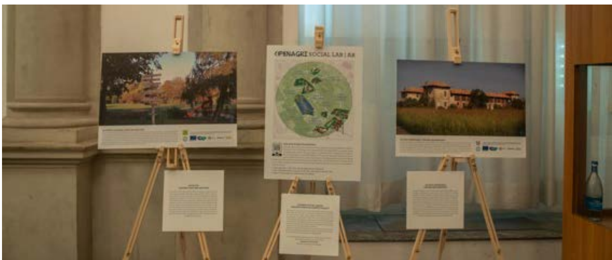
Telling OpenAgri stories