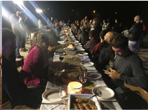
Land observation and social dinner

The idea of Legacy may remind us of the end of the project, but it's not the end that we are talking about. Being reminded of the end of the project is actually a good thing, because informs about the need and urgency to make the project activities sustainable and to prepare the