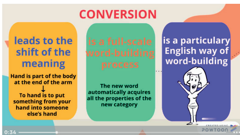
Figure 3. The example of a task created by students using the Powtoon digital tool

Most often, teachers use digital tools in lectures (60.9%) and practical classes (65.2%), less often in seminars (38%) and laboratory classes (25%). 2.2% of teachers use digital tools during other classes.