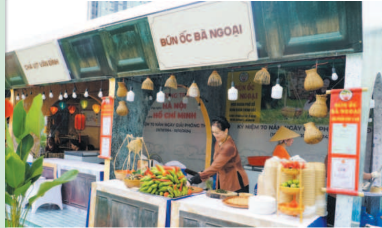
Hanoi is establishing many showrooms to promote and sell OCOP products linked to tourism and local craft villages