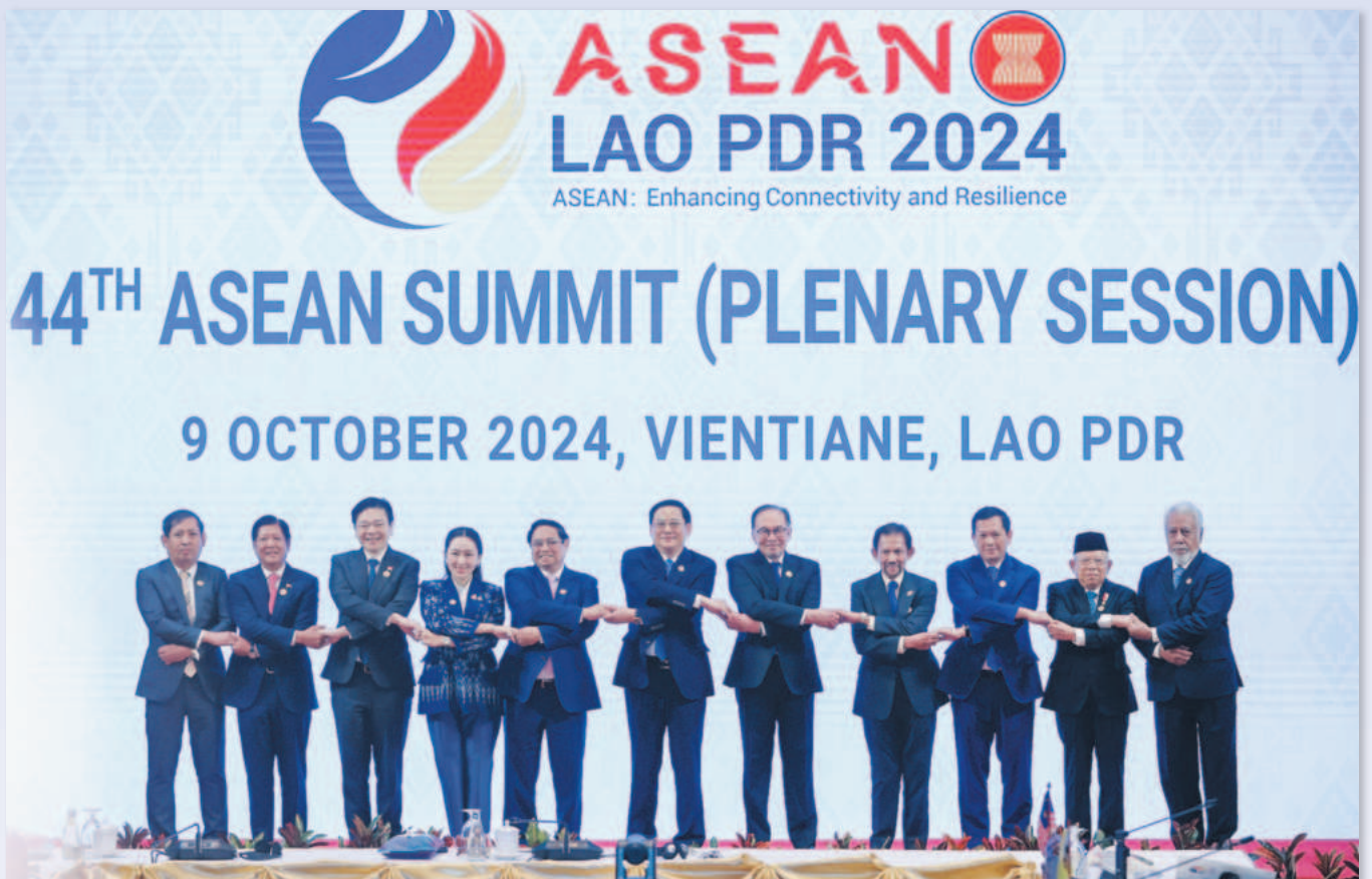
Prime Minister Pham Minh Chinh and ASEAN leaders at the ASEAN Summit