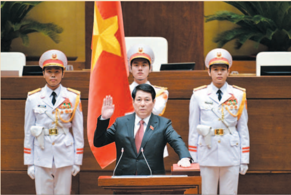
President Luong Cuong takes the oath of office at the 8th plenary meeting of the National Assembly

In his address to the National Assembly, newly elected State President Luong Cuong affirmed he would try his best to fulfill his presidential duties according to the Constitution of the Socialist Republic of Vietnam and the tasks entrusted him by the Party, the State and the People.