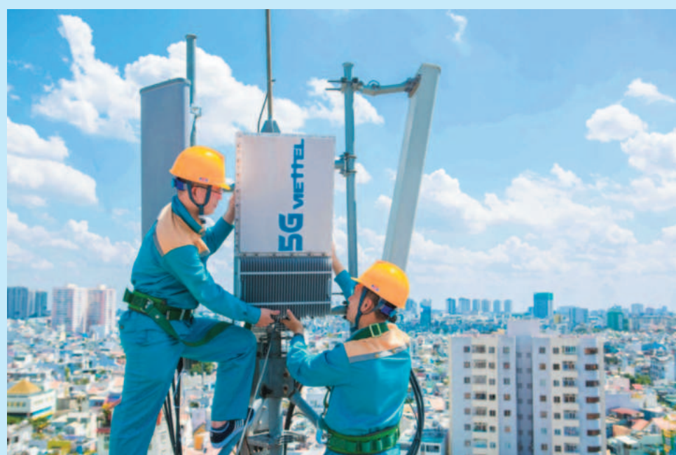
5G will play an important role in advancing Vietnam's digital infrastructure development

revenue hit US$6.64 billion, up 9.9%. Digital exports were projected at US$100.8 billion, growing by 18.3%. Major firms like Samsung, Qualcomm, Infineon and Amkor are investing billions in manufacturing expansion, with many large-scale projects under negotiation.