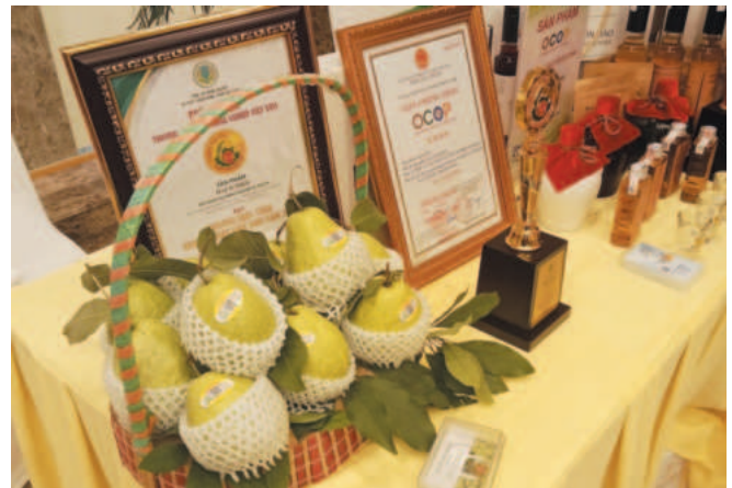
OCOP plays an important role in the socio-economic development of My Duc district

In Bot Xuyen Agriculture Cooperative that supplies agricultural products, Dien Bot Xuyen grapefruit is a highly commercial product for its members. The cooperative planned to build and develop Dien grapefruit into a key crop of the district. Currently, the grapefruit has been awarded a 3-star OCOP certificate by the Hanoi People's Committee.