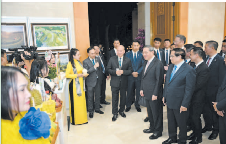
Prime Minister Pham Minh Chinh and Chinese Premier Li Qiang visit the exhibition of Vietnam's premium agricultural products for export to China

K nown as the "coconut land of Vietnam", Ben Tre boasts the largest coconut cultivation area in Vietnam, covering over 79,000 ha and producing more than 700 million coconuts annually. Recently, the General Administration of Customs of China (GACC) approved 133 coconut growing areas and packaging facilities in Ben Tre, recognizing their adherence to China's production standards. Ben Tre has also registered a code for a designated fresh coconut export area of over 8,000 ha,