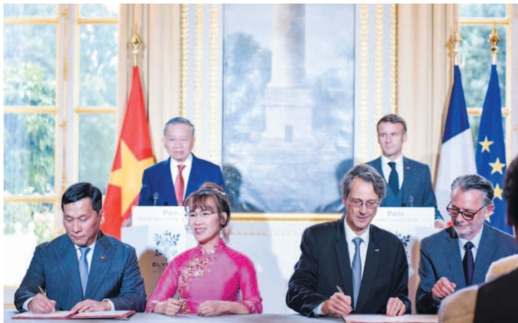
General Secretary and President To Lam and French President Emmanuel Macron witness the signing of several cooperation agreements between Vietnam and France

France has always been one of Vietnam's leading economic partners in Europe and the EU, with diverse and long-term economic cooperation ties. France is currently Vietnam's fourth largest trading partner in the EU with a