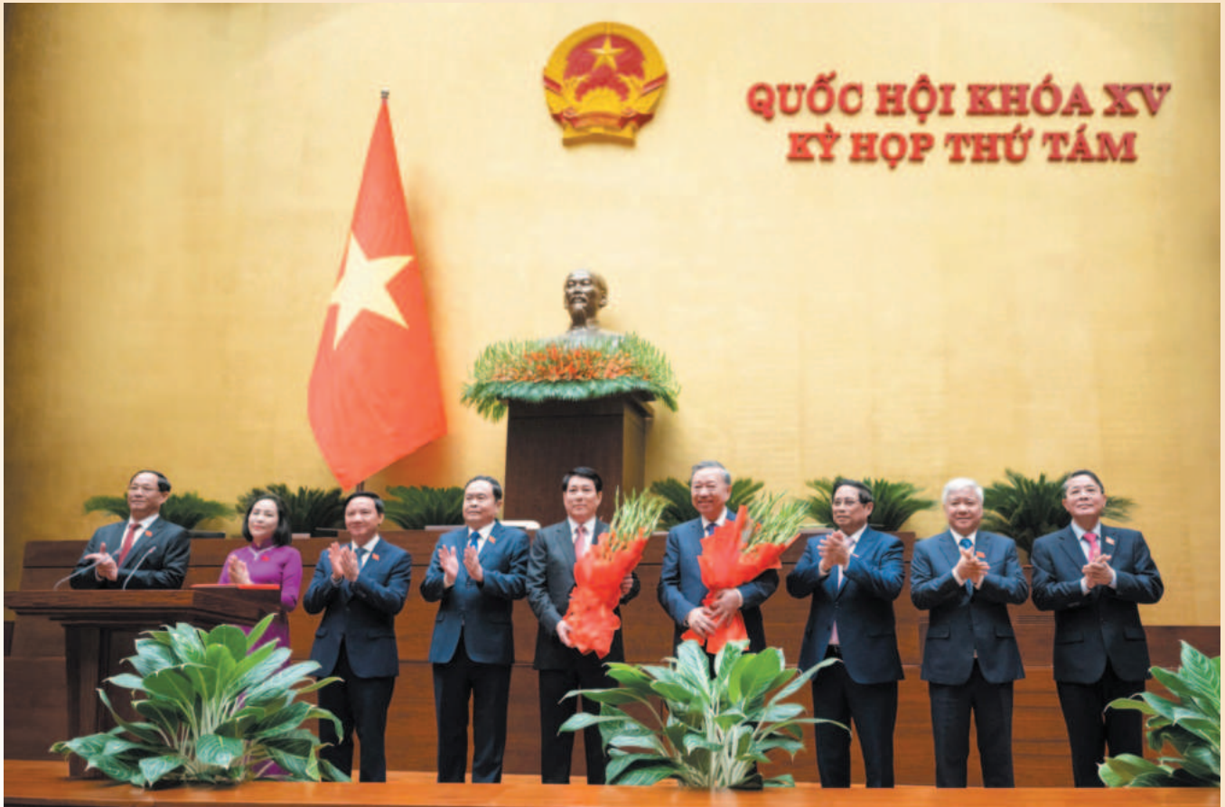
Leaders of the Vietnamese Party and State present bouquets of flowers to General Secretary To Lam and newly elected President Luong Cuong

profound gratitude to the Party, the State, the Army, and the Party committees and authorities at all levels. He thanked current and former leaders, comrades, and teammates, as well as the People, for their support, guidance and care, which have enabled him to fulfill his duties.