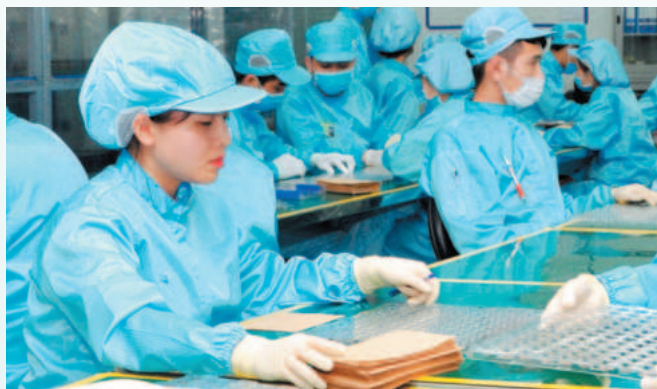
Young Poong Electronics Vina Co., Ltd, a wholly Korean-owned enterprise, provides stable employment for over 1,000 workers

With its geographical location, well-developed infrastructure and transparent investment attraction policies, Vinh Phuc's industrial parks have emerged as favored destinations for foreign investors including those from Korea.