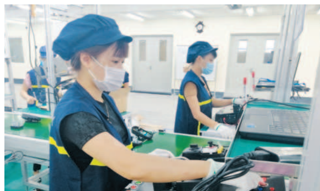
Assa Abloy Smart Product Vietnam at Ba Thien Industrial Park

A ccording to a report released by the Vinh Phuc Industrial Zones Management Board, in the first nine months of 2024, the board completed procedures for investment certificates for 37 new projects and 34 existing projects with a total