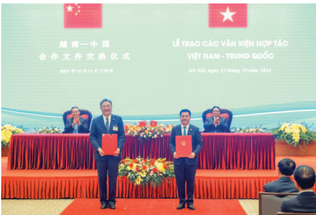
Prime Minister Pham Minh Chinh and his Chinese counterpart Li Qiang witness the exchange of an MoU between the Vietnam's Ministry of Industry and Trade and China's Ministry of Commerce

The two sides committed to promoting and supporting reputable companies with advanced technologies to invest in each other's markets. Their collaboration will focus on high-tech agriculture, infrastructure, clean energy, the digital economy and sustainable development. They aim to establish a fair and conducive business environment for enterprises from both countries.