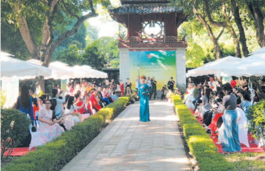
Ao Dai Festival 2024 made a good impression on visitors, creating new opportunities for the city's tourism industry

The successful Hanoi Tourism Ao Dai Festival has opened a new pathway for developing tourism products closely tied to cultural heritage.