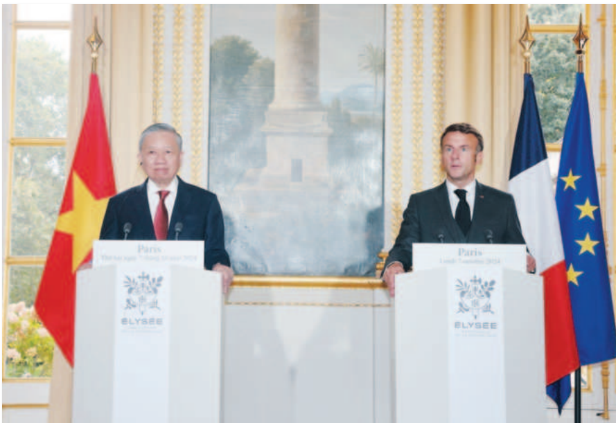
Vietnam’s General Secretary and President To Lam (left) and French President Emmanuel Macron at a press briefing before their talks in Paris

A fter concluding his activities at the 19th Francophone Summit, General Secretary and President To Lam and the high-ranking Vietnamese delegation paid an official visit to France at the invitation of President Emmanuel Macron.