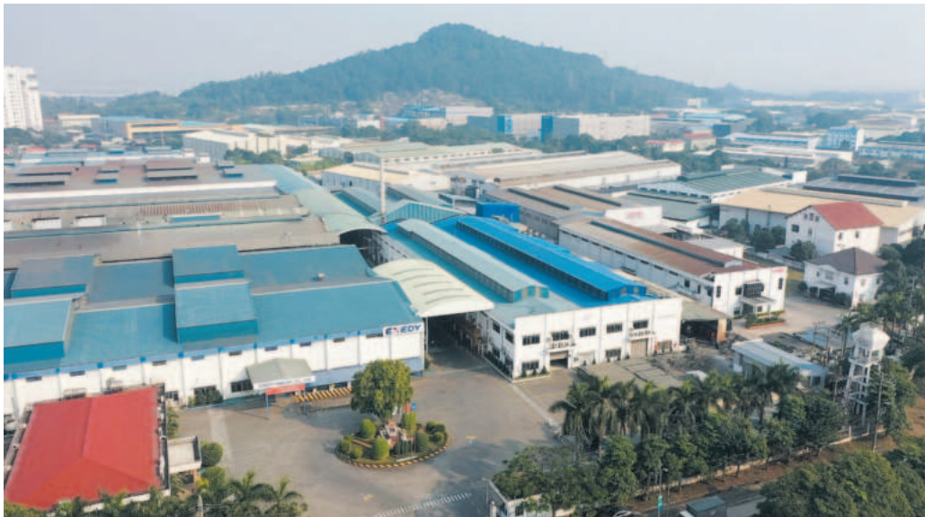
Overview of Khai Quang Industrial Park

As of now, Vinh Phuc province has established 17 industrial parks (IPs), comprising 4 with foreign investment and 13 with domestic investment, totaling approximately US$246.82 million and VND17,662 billion in registered capital. The approved construction planning covers a total area of 3,142.96 hectares, with 2,356.85 hectares designated for industrial and service use. Currently, nine industrial parks are operational, and the industrial land leased to secondary investors for factory construction amounts to 1,051.67 hectares.