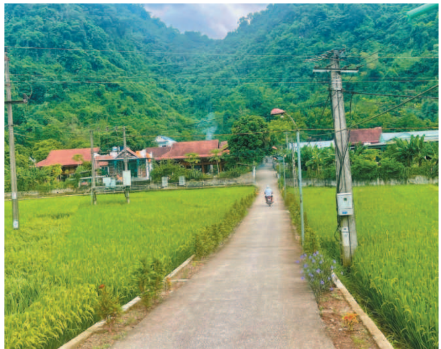
The improvements are clearly reflected in Hanoi's upgraded infrastructure

According to the Hanoi Coordination Office for New Rural Development, by the end of the third quarter of 2024, all 382 communes in the city have met new rural standards, with 188 communes achieving advanced standards and 76 recognized as model communes. Furthermore, all 18 districts and towns (100%) have met new rural standards. Notably, Thanh Tri has become the first district to achieve advanced new rural status, while Dong Anh, Gia Lam, Dan Phuong, Thuong Tin, and Thanh Oai are on track to be recognized as advanced districts. ■