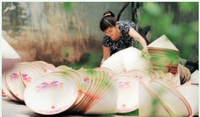
Chuong Village is renowned as one of the most famous cradles for conical hat making in Hanoi