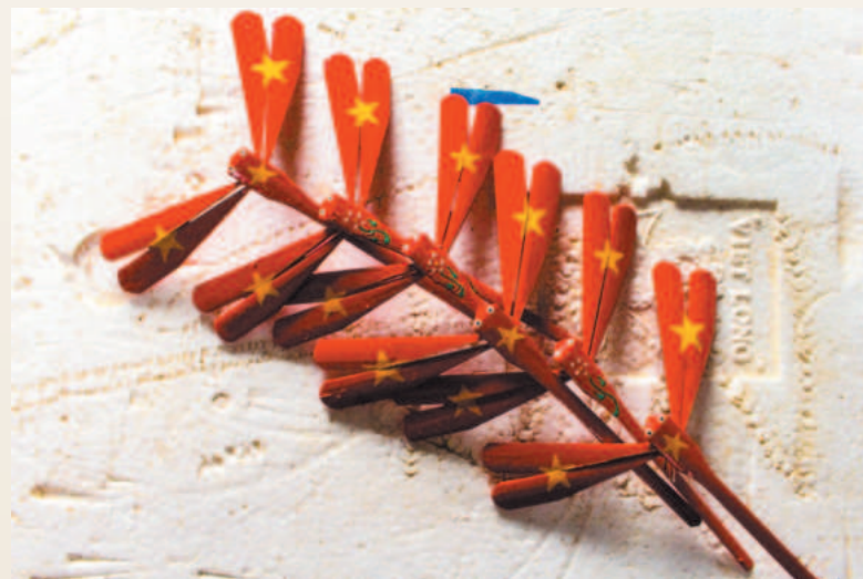
The unique charm of Thach Xa bamboo dragonflies is rooted in their designs, which are inspired by rural life

The robust development of rural agritourism has enabled bamboo dragonflies to freely show off their colors to visitors from all over the world at tourist destinations. Each bamboo dragonfly that flies far away not only demonstrates the creativity of Vietnamese craftspeople, but also contains many profound cultural values with the hope of highlighting the national cultural identity. ■