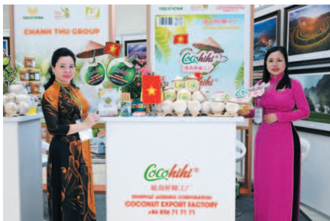
Cultivated and processed without chemicals, Vinh Phat's CocoHihi organic fresh coconuts adhere to strict organic standards

Vinh Phat's CocoHihi organic fresh coconuts embody a blend of tradition and modernity, profit and social responsibility, as well as quality and international certification. CocoHihi organic fresh coconuts are set to conquer even the most demanding markets, establishing themselves as a source of pride for Vietnamese agriculture. ■