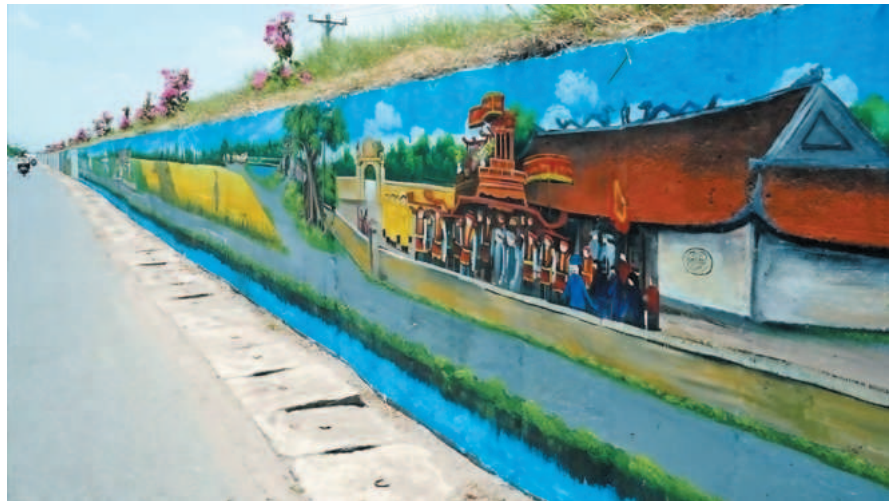
The New Rural Development Program has enhanced village roads, making them more spacious and aesthetically pleasing

When the new rural construction began, the income of Hanoi farmers was about VND10 million per person per year. After more than 13 years, this average has risen to over VND70 million. This significant increase reflects the commitment of Party committees and authorities to prioritize farmers' incomes as a foundation for building new rural areas. It has also encouraged farmers to innovate and adopt a multi-value integrated economic mindset.