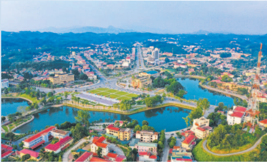
The development of the transport infrastructure system serves as a catalyst for the growth of Yen Bai province

Large-scale transport projects have been invested in to boost Yen Bai's regional connectivity and develop key economic zones.