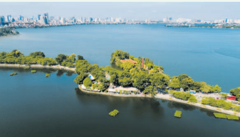
Hanoi's socioeconomic performance over the past 70 years has attained remarkable growth and impressive achievements