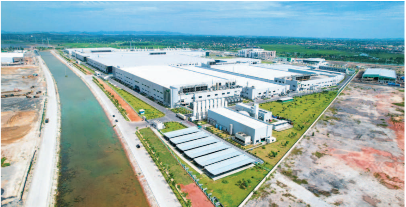
Amata City Ha Long (Song Khoai Industrial Park)