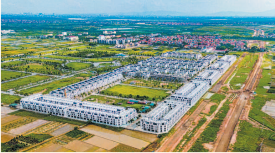
Me Linh district is striving to enhance advanced rural criteria, with a particular focus on developing infrastructure to support urbanization

The Rural Development Program in Me Linh district has led to beautiful, civilized villages and improved the material and spiritual lives of residents in the district.