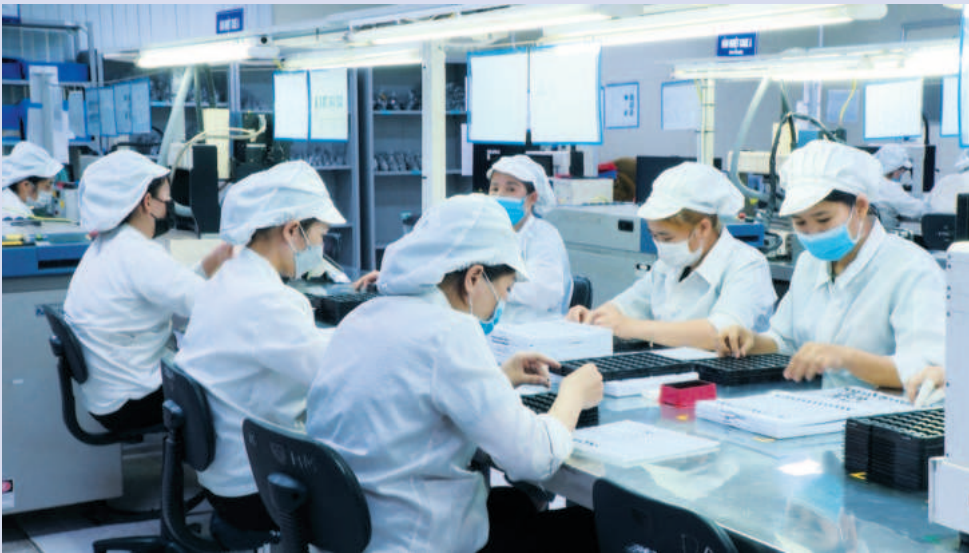
Jahwa Vina Co., Ltd at Khai Quang Industrial Park

Since the beginning of the year, the global market has shown signs of recovery, leading to an increase in orders across traditional markets. As a result, enterprises operating in Vinh Phuc industrial parks (IPs) have experienced good growth in their production and business outcomes compared to the same period in 2023.