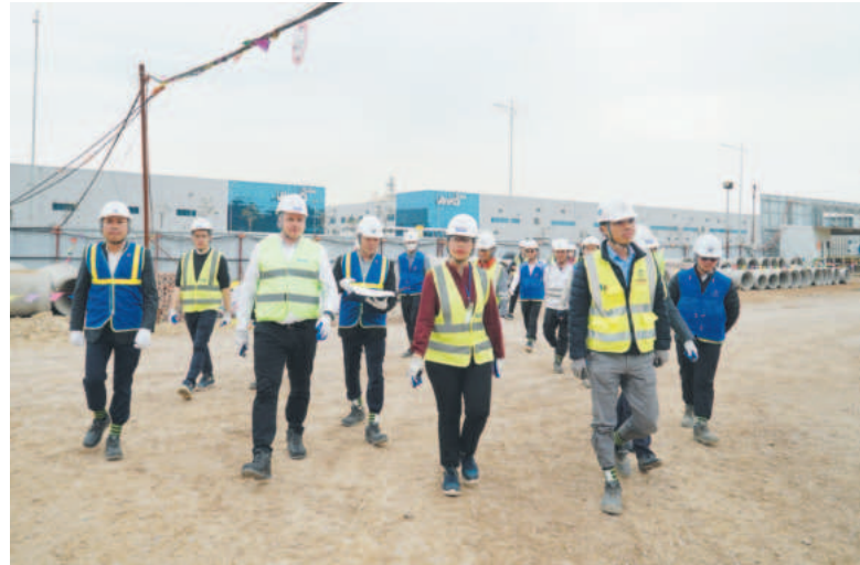
Chairman of Autoliv paid a working visit to the Autoliv Vietnam factory project in the Amata City Ha Long (Song Khoai Industrial Park) in Quang Yen town, March 2023

In addition, the town effectively promotes localized investment promotion with many practical solutions like accompanying businesses, serving businesses from the smallest things, and creating the trust of investors and businesses. In early March 2024, Quang Yen established a working group to support and promote local investment to actively grasp information, promptly resolve recommendations and problems of investors. Thus, the town has continuously stood among the best performers in the District and Department Competitiveness Index (DDCI) in Quang Ninh province since 2019. In 2019 and 2021, it topped all localities in the DDCI Index.