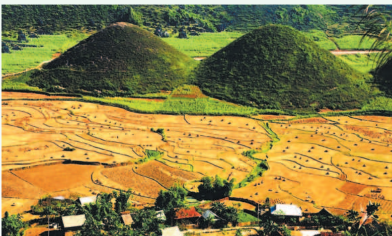
Quan Ba Twin Mountain is a must-visit destination in Ha Giang for nature lovers

With the efforts from government authorities, businesses, and local communities, Ha Giang province is gradually reclaiming its position as a safe and attractive destination after the challenges posed by the natural disaster. The province hopes to attract an increasing number of visitors, particularly international tourists, due to its unique cultural values and stunning natural landscapes. ■