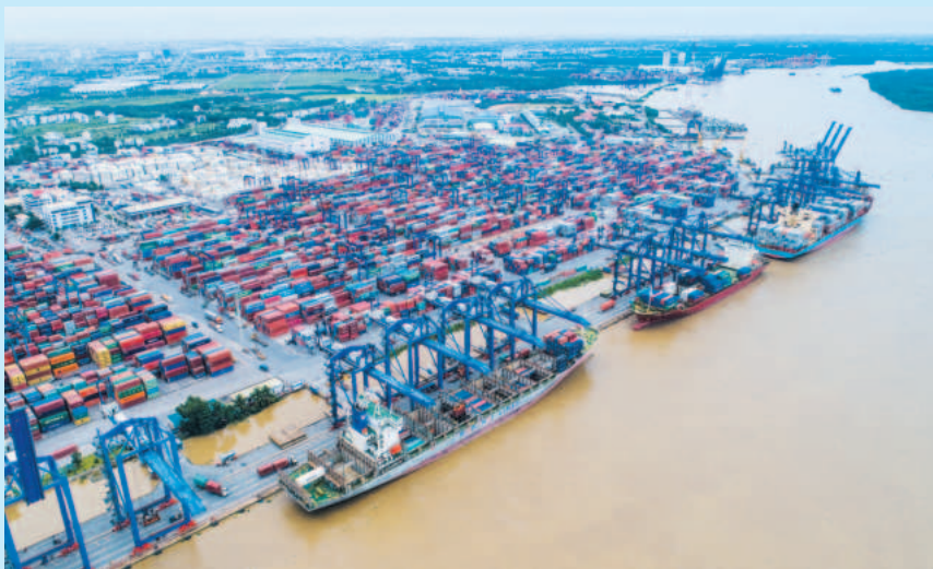
Merchandise exports are a bright spot for Vietnam's economy, supported by the recovery in global trade growth

The Prime Minister emphasized 12 groups of key solutions and five important and urgent tasks for the coming time. The 12 groups of key solutions include focusing on overcoming the consequences, preventing and combating natural disasters, stabilizing people's lives, and promoting business recovery; carefully preparing, ensuring the progress