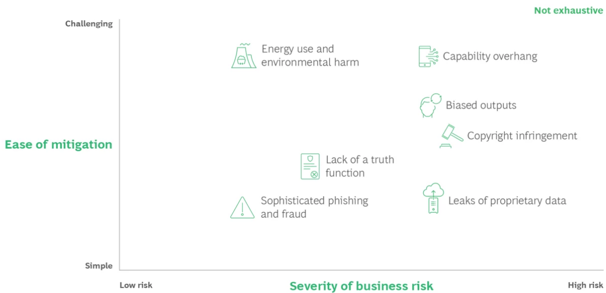
Exhibit 3 - Generative AI Poses a Range of Risks