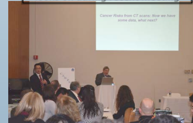
Cancer Risks from CT scans: Now we have some data, what next?