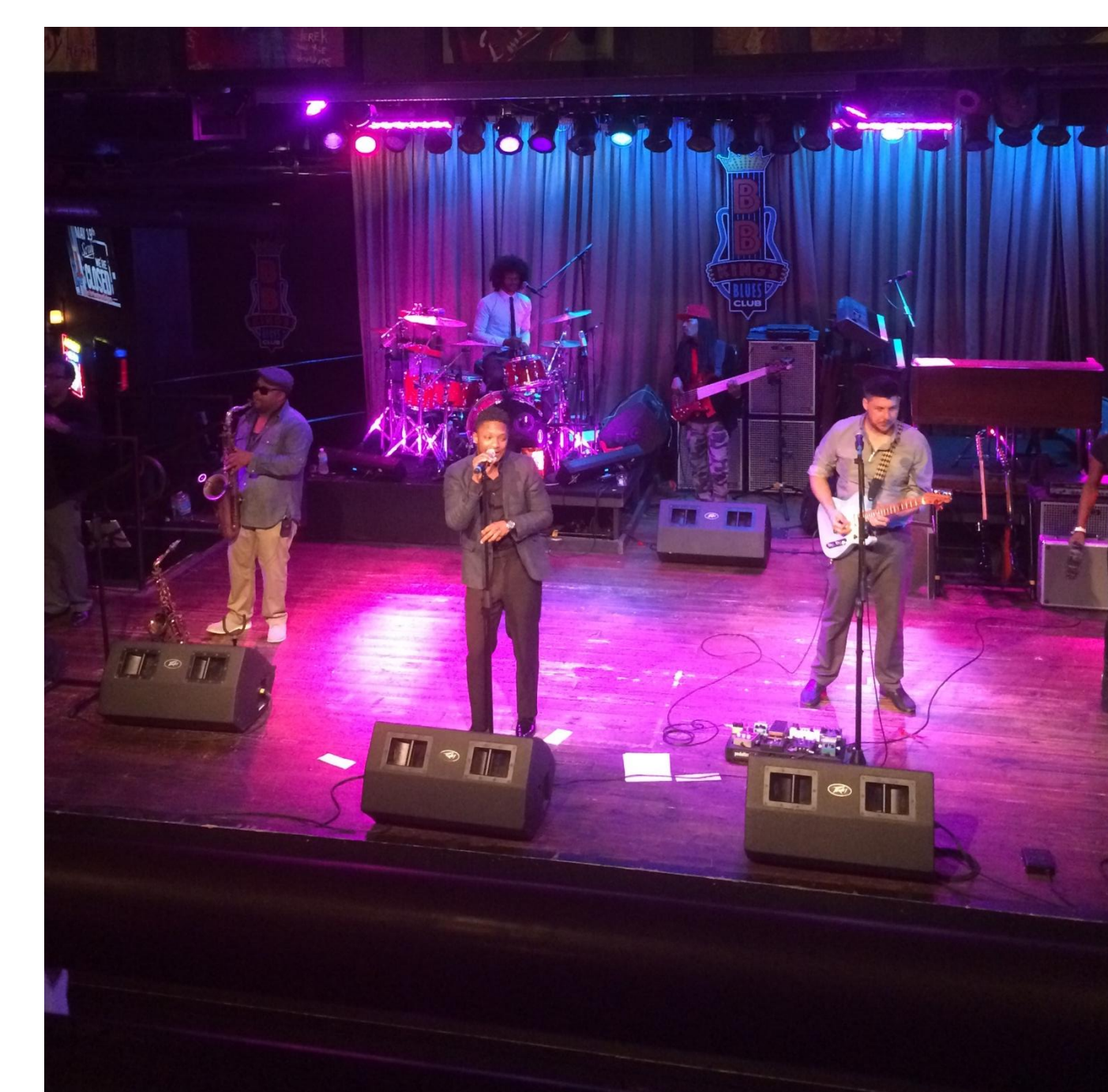
The night outs during the chapter meeting were the highlight of the social event, where members often connected professionally,