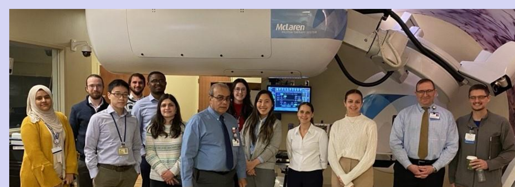
GLC Residents visiting a local proton facility

Rotations include: Proton Therapy, MR adaptive therapy, Gamma Knife, TSET/TBI, and CyberKnife