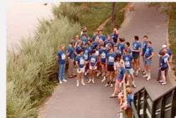
First "AAPM Fun Run" at the 1981 AAPM Annual Meeting in Boston. Runners assembled at the start.