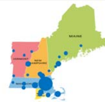
Geographical distribution of members