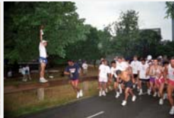
"AAPM Fun Run" at the 1995 AAPM Annual Meeting in Boston: runners starting the race, by the Charles River.