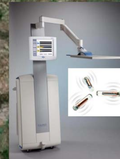
Calypso® System, for real-time tumor motion tracking, developed in Seattle and acquired by Varian in 2011