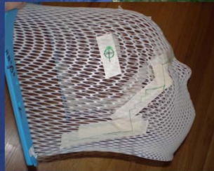
Frameless Stereotactic Localization