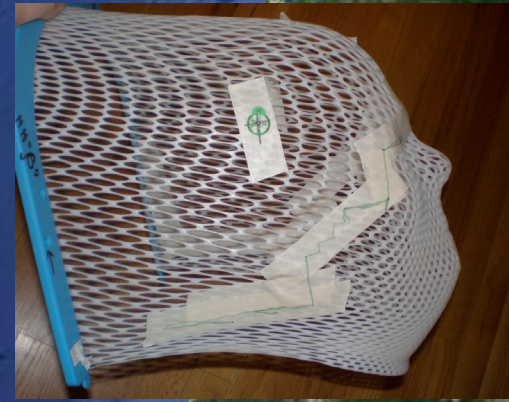
Frameless Stereotactic Localization