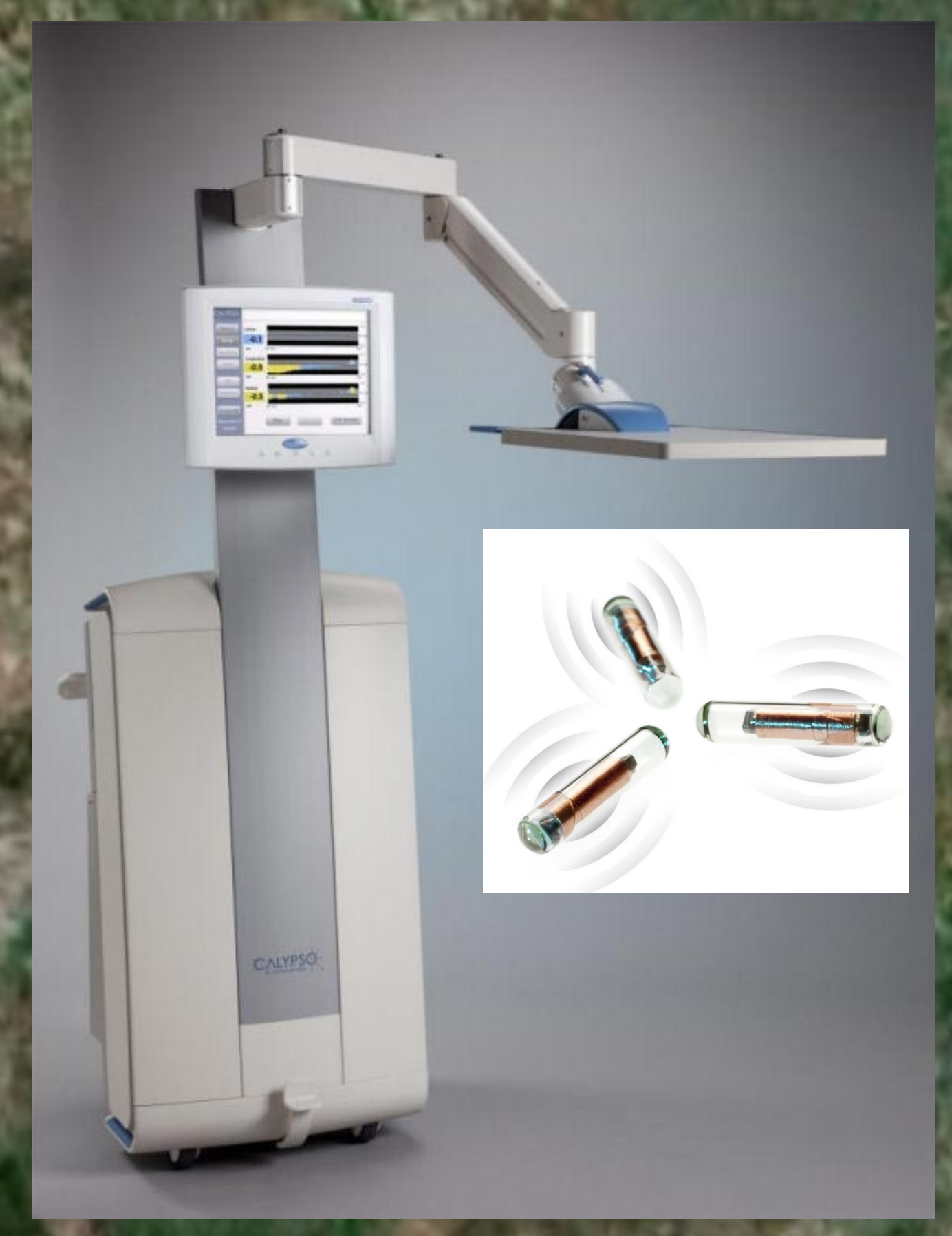
Calypso ® System, for real-time tumor motion tracking, developed in Seattle and acquired by Varian in 2011