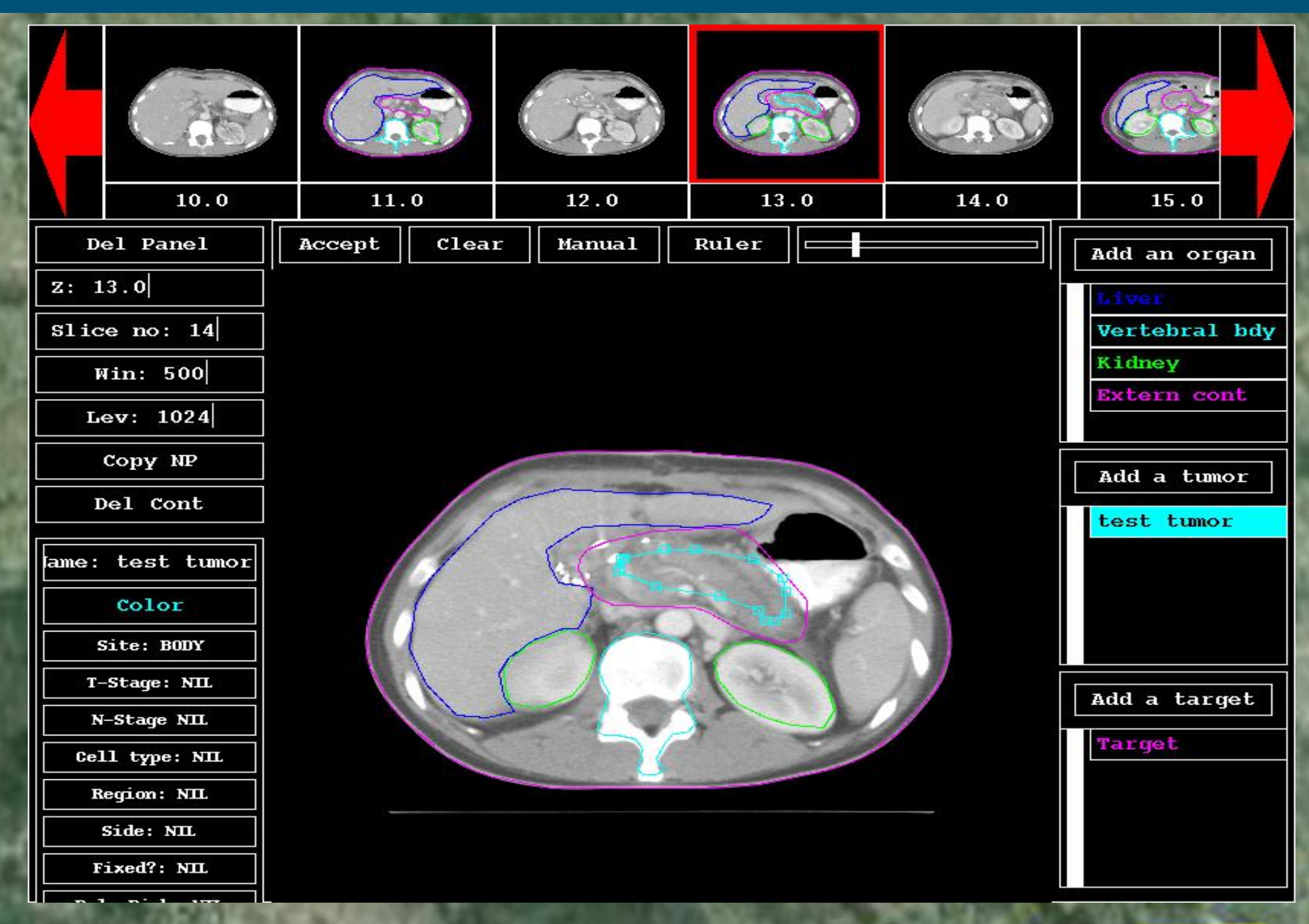
Prism RTP system, developed at the University of Washington in 1994