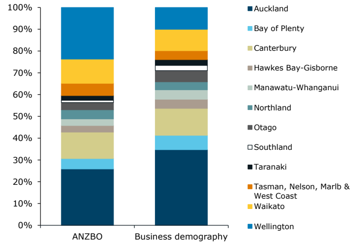
Figure 2: ANZBO and business demography regional breakdown

The survey represents NZ businesses well among regions, with two notable exceptions. The survey is overrepresented by businesses operating in Wellington and underrepresented in Auckland.