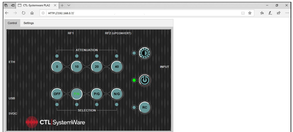
Browser control interface

This material consists of CACI International Inc general capabilities information that does not contain controlled technical data as defined within the International Traffic in Arms (ITAR) Part 120.10 or Export Administration Regulations (EAR) Part 734.7-10. (PR ID317)