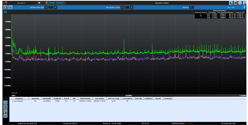
Quickly scan three states of power line conductors (-SW Sensor Sweep w/PLA II)