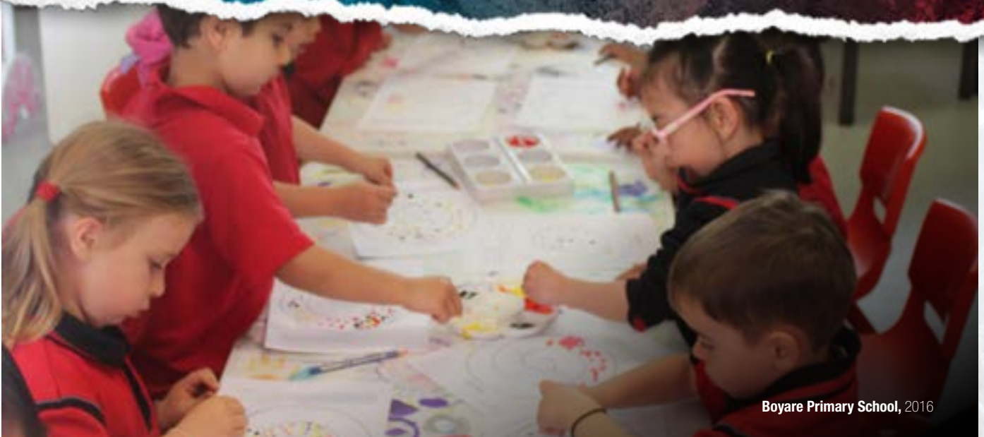
Boyare Primary School, 2016