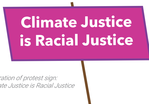
Illustration of protest sign: Climate Justice is Racial Justice

equality and freedom for those deemed 'irregular'. Rather than 'no human is illegal', the effect of EU policy is that some humans are, and as such cannot access some of the most basic rights and services necessary for human existence. Moreover, EU migration policy acknowledges the integration and socio-economic hardships experienced by migrants, but not the structural conditions which criminalise movement, specifically the role of institutions and states including EU agencies such as FRONTEX (the EU's border management agency), which has been alleged to play a significant a role in illegal pushbacks 2 and other forced returns.