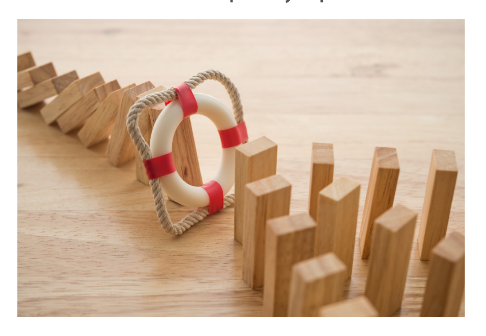
Part 2: Future challenges, parliamentary control and policy options