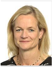
LEAD MEMBER: VIOLA VON CRAMON-TAUBADEL