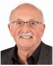
LEAD MEMBER: UDO BULLMANN, CHAIR OF THE EP SUBCOMMITTEE ON HUMAN RIGHTS