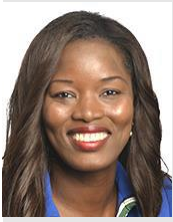
LEAD MEMBER: ASSITA KANKO