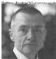
Willie Walsh CEO IAG Panelist ( https://qatar20.capaevents.com/agenda/speakers/551557 )