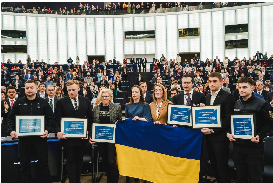
Representatives of the Ukrainian people with Parliament President Roberta Metsola during the ceremony