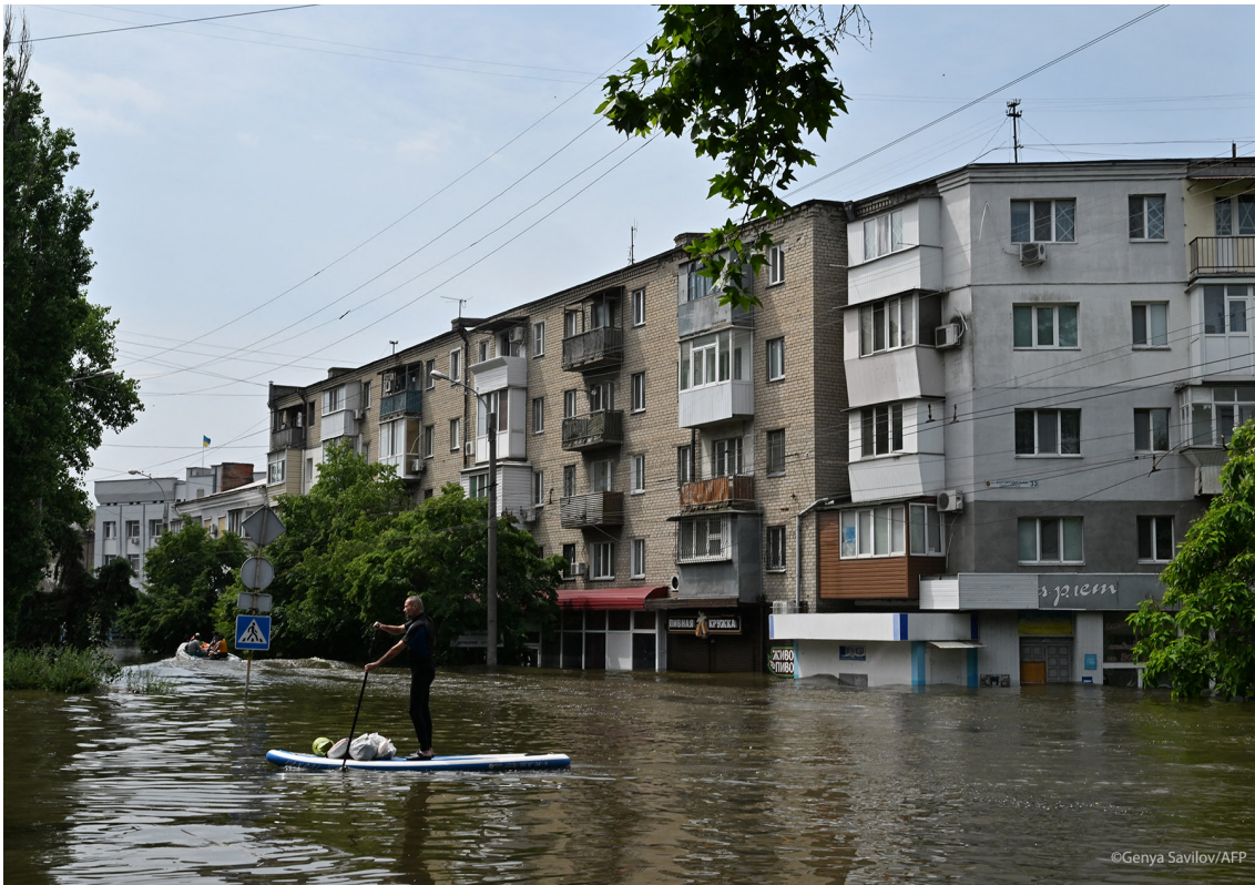
Parliament wants Ukraine to be invited to join NATO