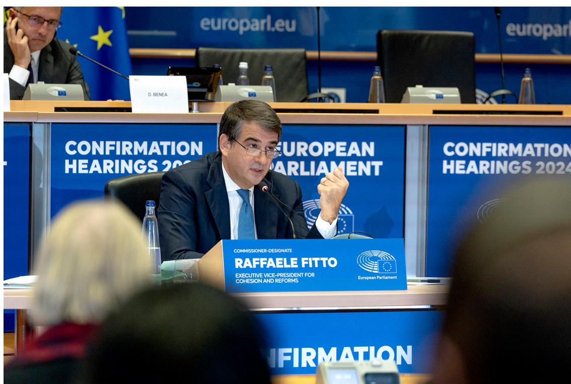
Raffaele Fitto during the confirmation hearing 2024

The Committee on Regional Development questioned Raffaele Fitto, Italian candidate for Commission Executive Vice-President responsible for cohesion and reforms.