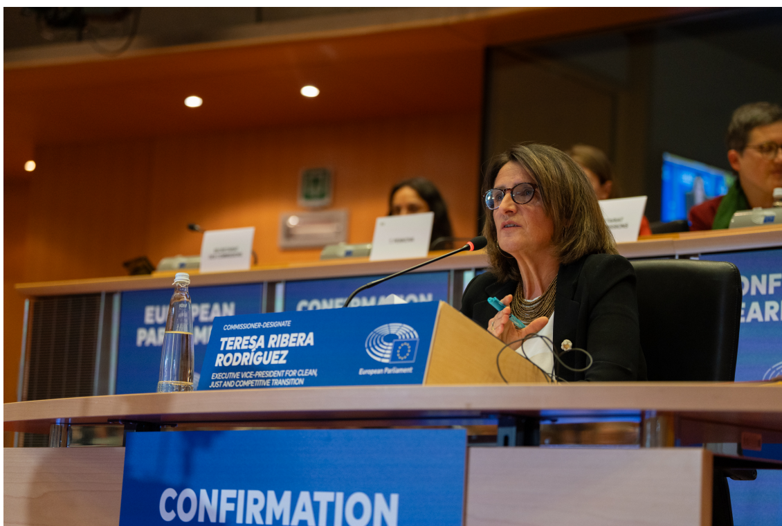
Teresa Ribera during the confirmation hearing 2024